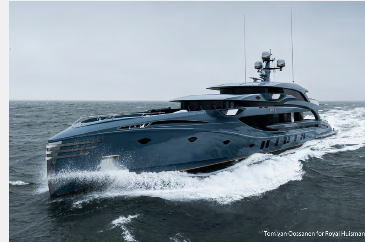
Project Phi 403 (2021)

CUSTOMER: Heesen Yachts TYPE: Motor Yacht TYPE OF WORK: Newbuild SCOPE OF SUPPLY: Engineering / Electrical Installation / Electrical Switchboards / MPA System (AMCS) / Power Management / Light Management / Audio-Video / IT Network