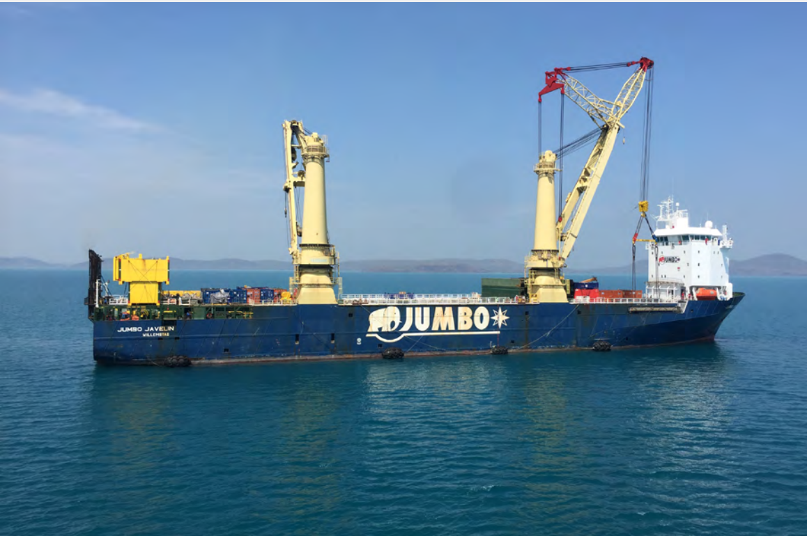
Jumbo Javelin (2020)

CUSTOMER: Jumbo Maritime TYPE: Heavy Load Carrier (144 m) TYPE OF WORK: Service SCOPE OF SUPPLY: Engineering, production of additional distribution for 6 additional generators. Including modifications to AMCS and PMS.