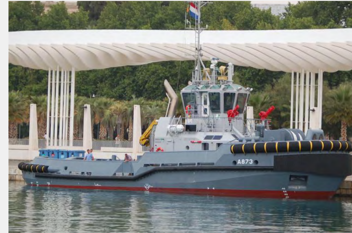
ASD Tug 2810 Hybrid (2018)

CUSTOMER: Damen Shipyards Group TYPE: ASD Tug 2810 hybrid TYPE OF WORK: Newbuild SCOPE OF SUPPLY: Infrastructure (Cable Routing, Cable Trays), Switchboards and Consoles.