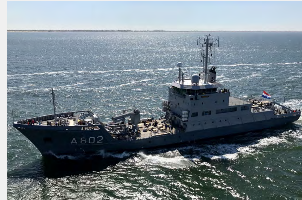
Zr.Ms. Snellius (2020)

CUSTOMER: Damen Naval TYPE: Naval Auxiliary Vessel (65 m) TYPE OF WORK: Refit SCOPE OF SUPPLY: Mid-Life upgrade and maintenance.