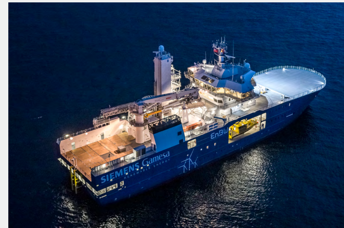
Bibby Wavemaster (2019)

CUSTOMER: Jumbo Maritime TYPE: Heavy Load Carrier (143.1 m) TYPE OF WORK: Service SCOPE OF SUPPLY: Refit AMCS, (network, PLC, SCADA).