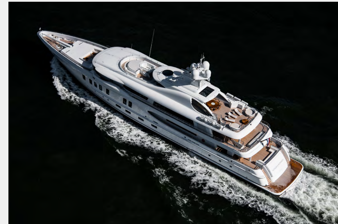
Amels 212 – Neninka (2019)

CUSTOMER: Damen Yachting TYPE: Motor Yacht (55 m) TYPE OF WORK: Newbuild SCOPE OF SUPPLY: System integration and complete electrical installation, navigation and communication system, alarm & monitoring system, AVIT system.