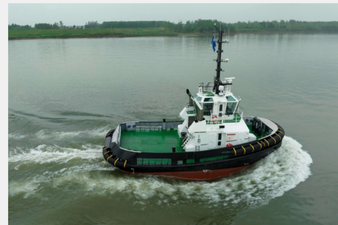
ASD Tug 2111 (2024)

CUSTOMER: Damen Shipyards Group TYPE: Fast crew suppliers TYPE OF WORK: Newbuild SCOPE OF SUPPLY: Engineering and switchboard package