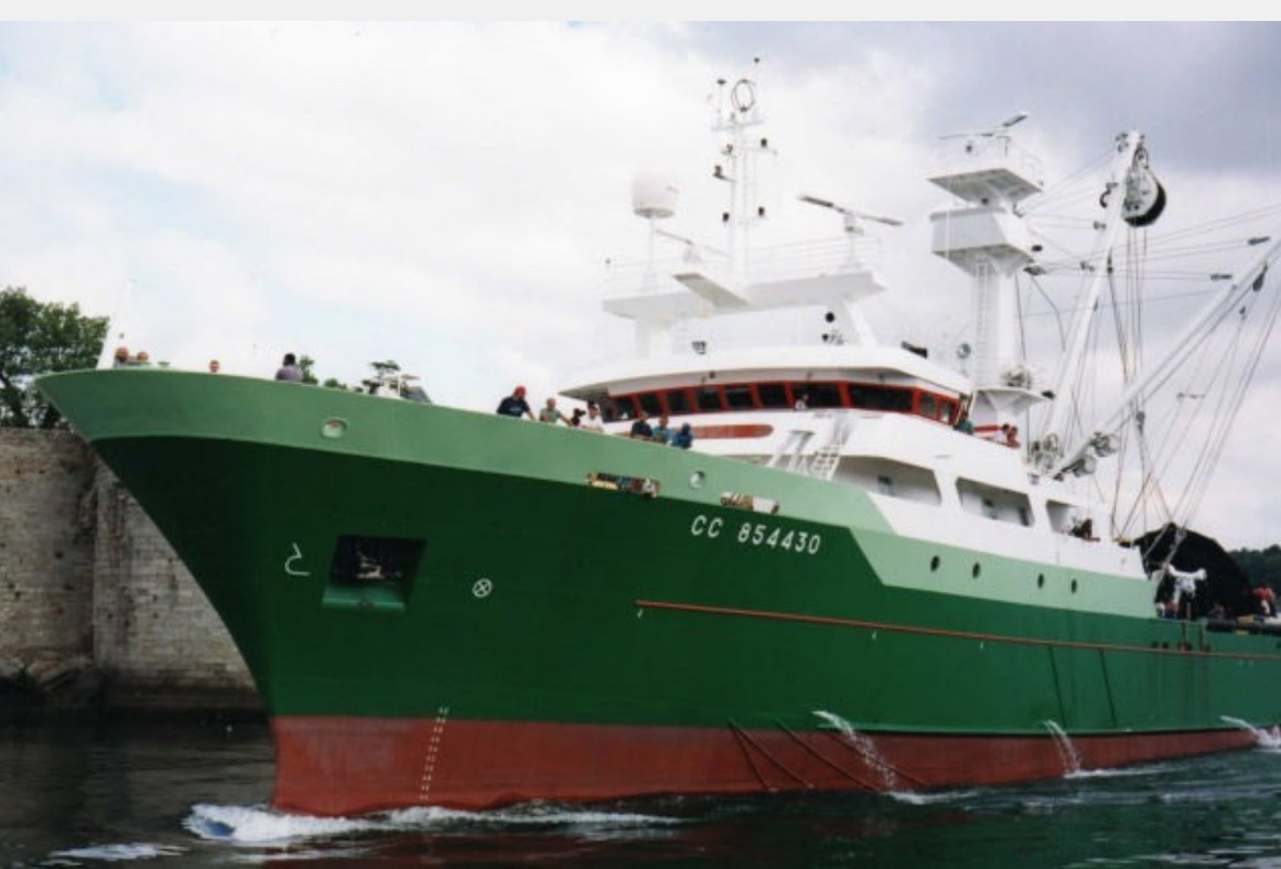
Tuna purse seiner 67m - C345 (2019)

CUSTOMER: Shipbuilding Asia TYPE: Fishing trawler 30m TYPE OF WORK: Newbuild SCOPE OF SUPPLY: Engineering e-system, cables routing, cables, switchboards package & AMS.