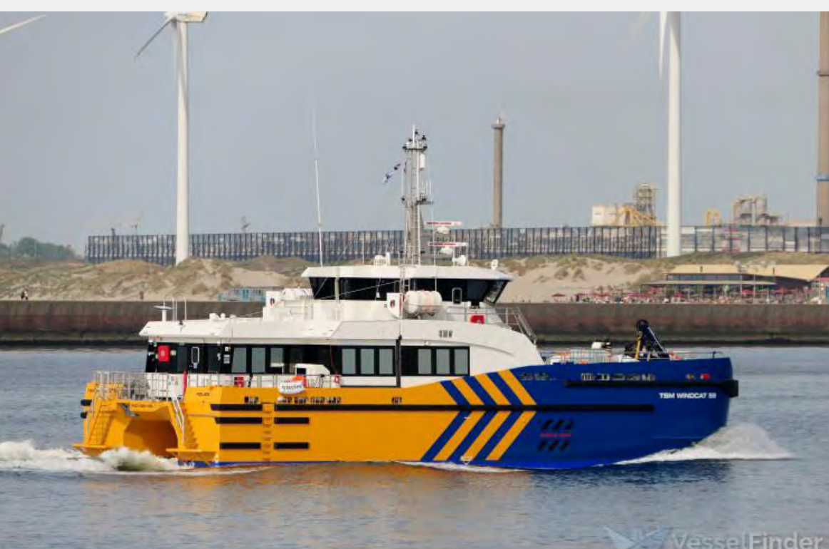
Windcat 59 (2025)

CUSTOMER: Dok en Scheepsbouw Woudsend TYPE: Search & Rescue Vessel TYPE OF WORK: Newbuild SCOPE OF SUPPLY: Engineering, installation and commissioning of complete electrical installation, including alarm, monitoring and control systems.