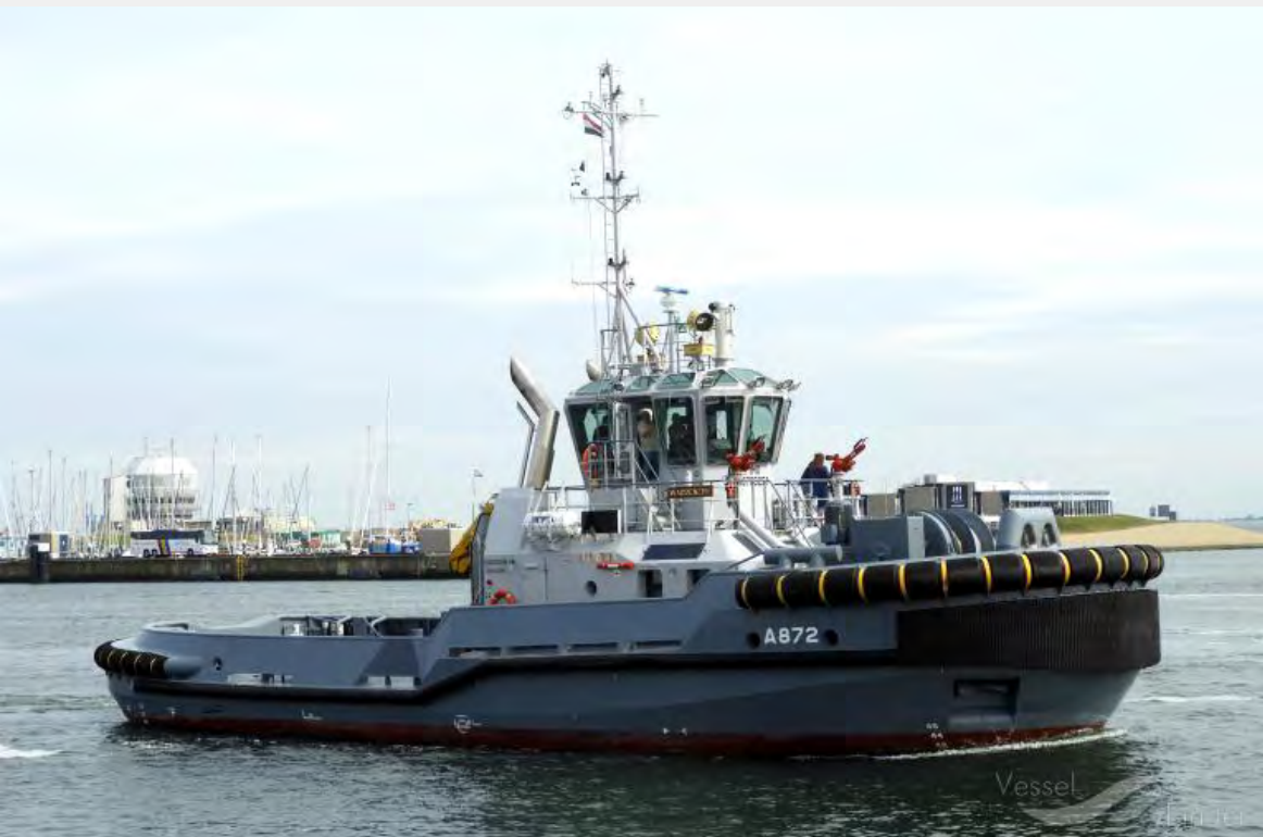
ASD Tug 2810 Hybrid (2018)

CUSTOMER: Damen Shipyards Group TYPE: ASD Tug 2810 hybrid TYPE OF WORK: Newbuild SCOPE OF SUPPLY: Infrastructure (Cable Routing, Cable Trays), Switchboards and Consoles.