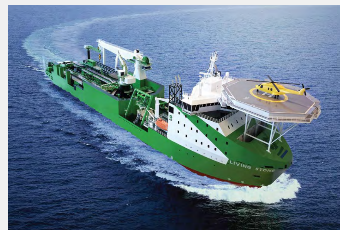
Living Stone (2018)

CUSTOMER: DEME TYPE: Jack-Up Vessel (89 m) TYPE OF WORK: Newbuild SCOPE OF SUPPLY: Vessel management system comprising power management, tank sounding, draught & loading system (ADLS) and secondary systems; KVM matrix solution for high level integrated bridges; installation helideck; ATEX inspection.