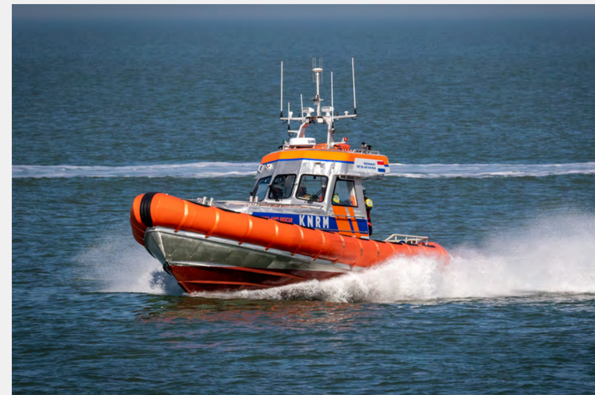
KNRM Van Wijk Class (2025)

CUSTOMER: Neptune Marine TYPE: Crew Transfer Vessel TYPE OF WORK: Newbuild SCOPE OF SUPPLY: Engineering, installation and commissioning of complete electrical installation, including alarm, monitoring and control systems, power management system, electrical distribution systems.