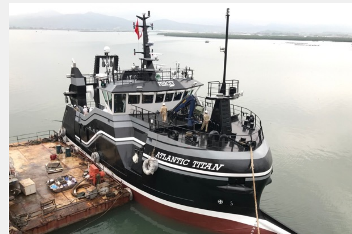
Atlantic Titan - Fishing trawler 30m (2019)

CUSTOMER: Damen Shipyards Group TYPE: Combi Freighter 3850 - multipurpose carriers (90 m) TYPE OF WORK: Newbuild SCOPE OF SUPPLY: Complete electrical engineering, cables & equipment delivery and commissioning works for: power generation and power distribution system, motor starters, alarm monitoring and control system, fire detection system, public address system, telephone system, etc.