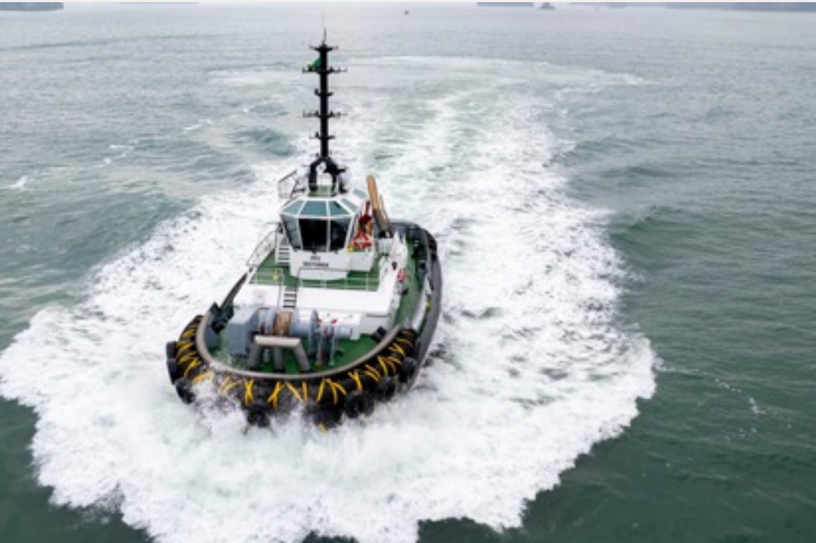
ASD Tug 2811 (2023)

CUSTOMER: Damen Shipyards Group TYPE: ASD Tug 2811 TYPE OF WORK: Newbuild SCOPE OF SUPPLY: Switchboard package & consoles