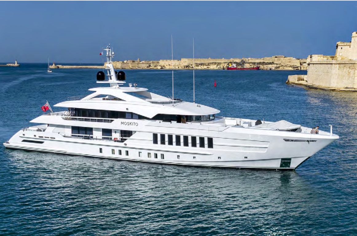
Moskito 19255 (2021)

CUSTOMER: Heesen Yachts TYPE: Motor Yacht TYPE OF WORK: Newbuild SCOPE OF SUPPLY: Engineering / Electrical Installation / Electrical Switchboards / MPA System (AMCS) / Power Management / Light Management / Audio-Video / IT Network