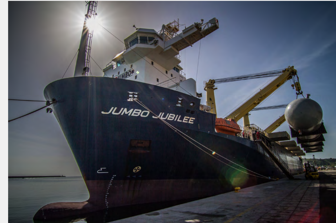
Jumbo Jubilee (2019)

CUSTOMER: Jumbo Maritime TYPE: Heavy Load Carrier (144 m) TYPE OF WORK: Service SCOPE OF SUPPLY: Engineering, production of additional distribution for 6 additional generators. Including modifications to AMCS and PMS.