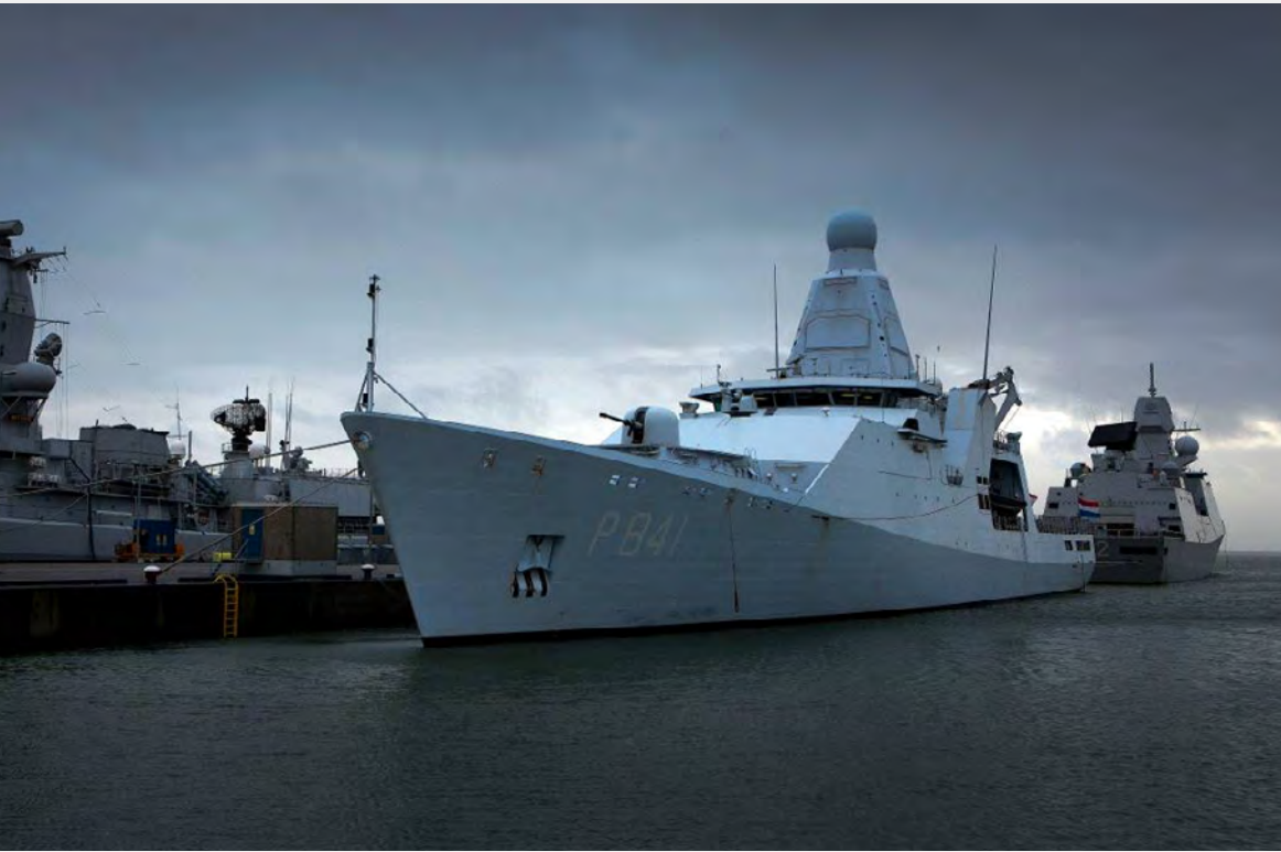
Zr.Ms. Zeeland (2013)

CUSTOMER: Damen Naval TYPE: Ocean-going Patrol Vessel (108.4 m) TYPE OF WORK: Newbuild SCOPE OF SUPPLY: Complete electrical systems integration, installing, supervising on site and commissioning.