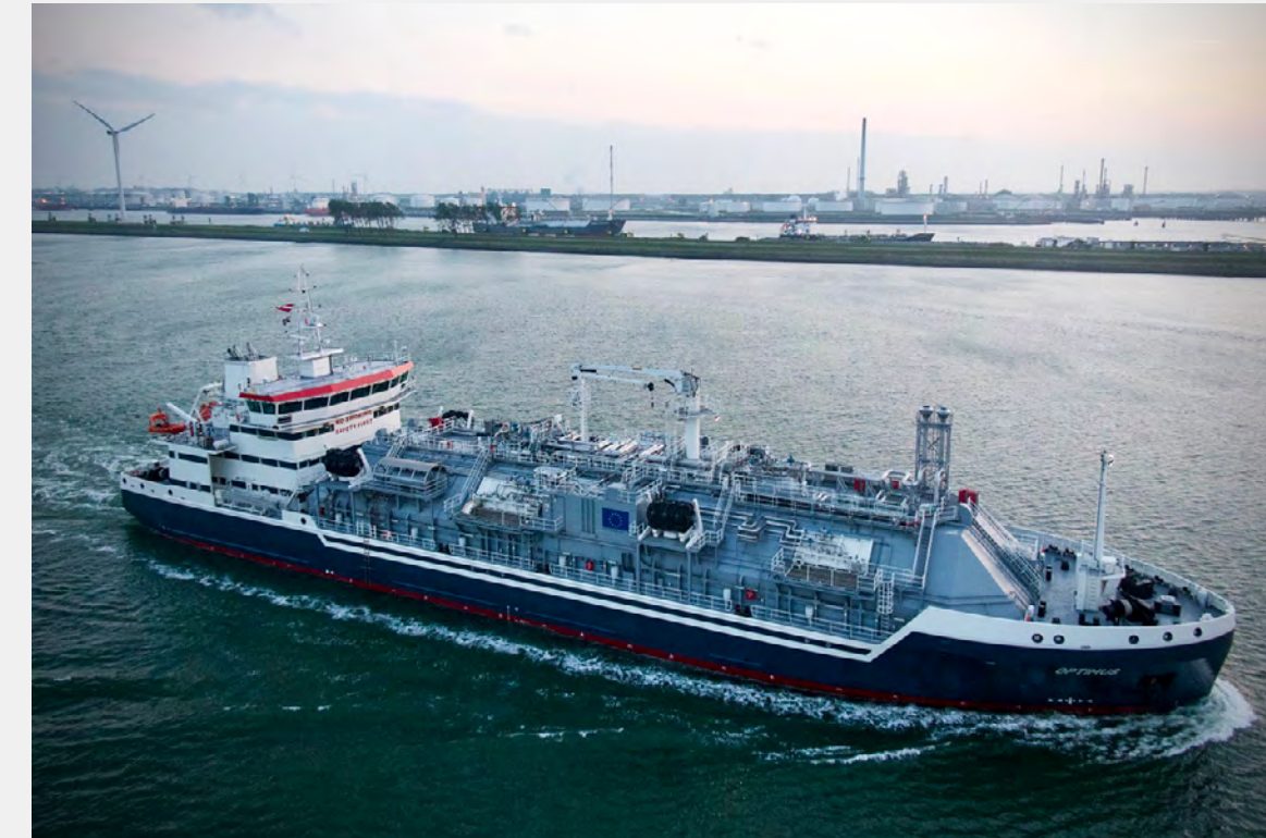
Optimus YN 559014 (2021)

CUSTOMER: Severnav Shipyard TYPE: 6500 m 3 liquified gas tanker and 8600 m 3 gas tankers TYPE OF WORK: Newbuild SCOPE OF SUPPLY: Complete electrical package, including engineering, commissioning, alarm, monitoring and control systems.