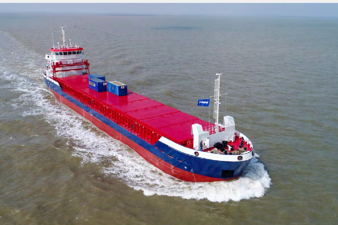
Sophie & Benabell G. YN 559012-13 (2021)

CUSTOMER: Damen Shipyards Group TYPE: Liquefied Gas Carrier (LGC) 6000 LNG s, Bunkering vessel (100 m) TYPE OF WORK: Newbuild SCOPE OF SUPPLY: Electrical Engineering and Integration, Equipment delivery, Supply and supervising of loose equipment and cables, Commissioning.