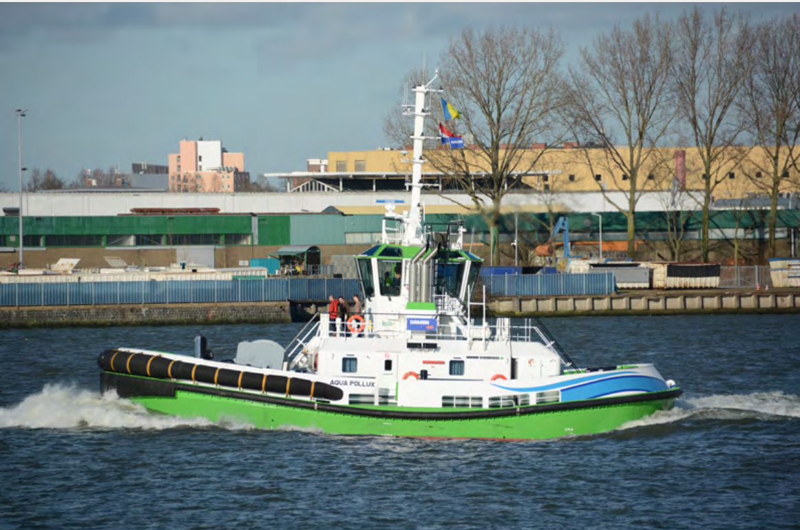
Aqua Pollux (2025)

CUSTOMER: Damen Shipyards Group TYPE: RSD Tug 2513 Electric TYPE OF WORK: Newbuild SCOPE OF SUPPLY: Switchboards and consoles delivery