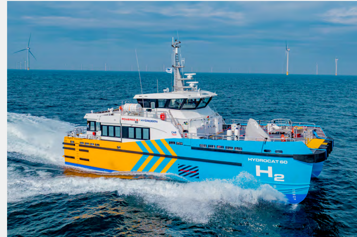
Hydrocat 60 (2025)

CUSTOMER: Damen Shipyards Group TYPE: Coast guard vessel TYPE OF WORK: Newbuild SCOPE OF SUPPLY: Full package of electric and alarm/monitoring system