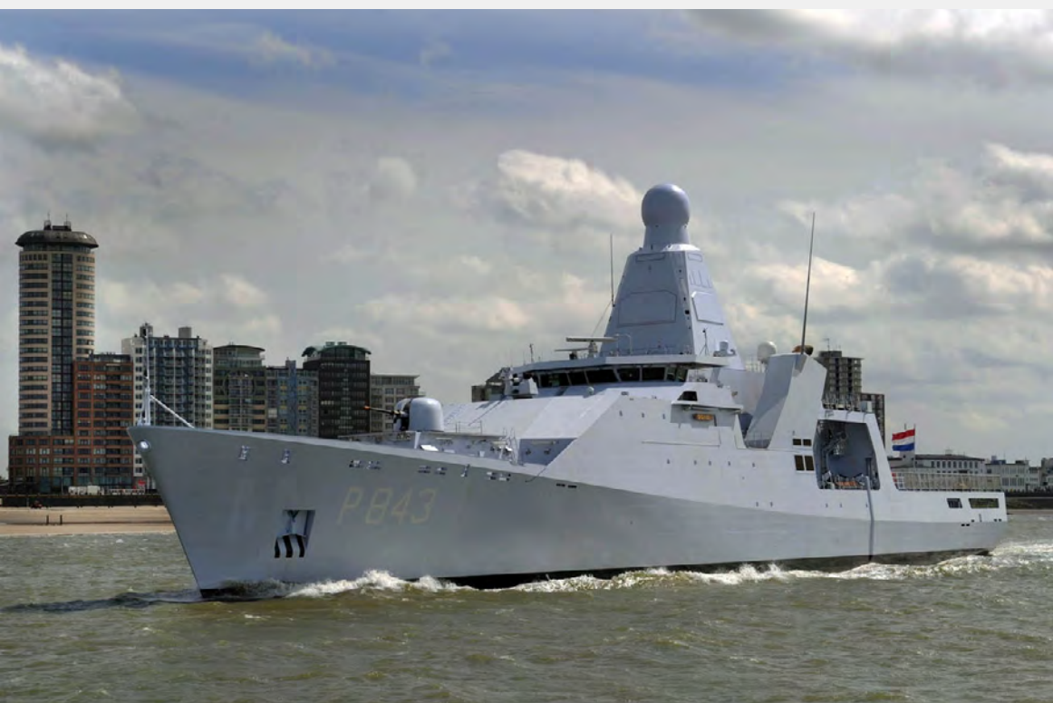
Zr.Ms. Groningen (2013)

CUSTOMER: Damen Naval TYPE: Ocean-going Patrol Vessel (108.4 m) TYPE OF WORK: Newbuild SCOPE OF SUPPLY: Complete electrical systems integration, installing, supervising on site and commissioning.