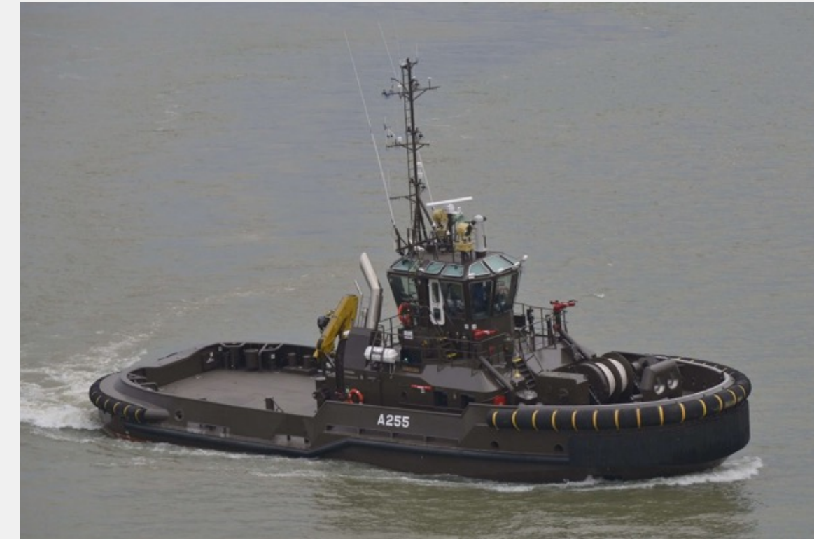
ASD Tug 3010 ICE (2023)

CUSTOMER: Damen Shipyards Group TYPE: ASD Tug 2811 TYPE OF WORK: Newbuild SCOPE OF SUPPLY: Switchboard package & consoles