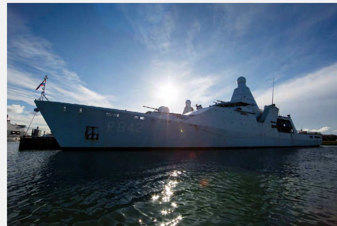
Zr.Ms. Friesland (2013)

CUSTOMER: Damen Naval TYPE: Ocean-going Patrol Vessel (108.4 m) TYPE OF WORK: Newbuild SCOPE OF SUPPLY: Complete electrical systems integration, installing, supervising on site and commissioning.