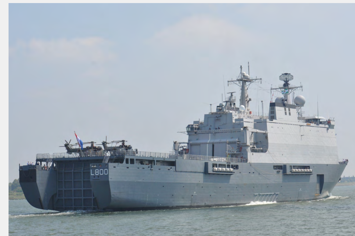
Zr.Ms. Rotterdam (2019)

CUSTOMER: R+S TYPE: Hydrografic Research Vessel (80 m) TYPE OF WORK: Refit SCOPE OF SUPPLY: Modifications PABX.