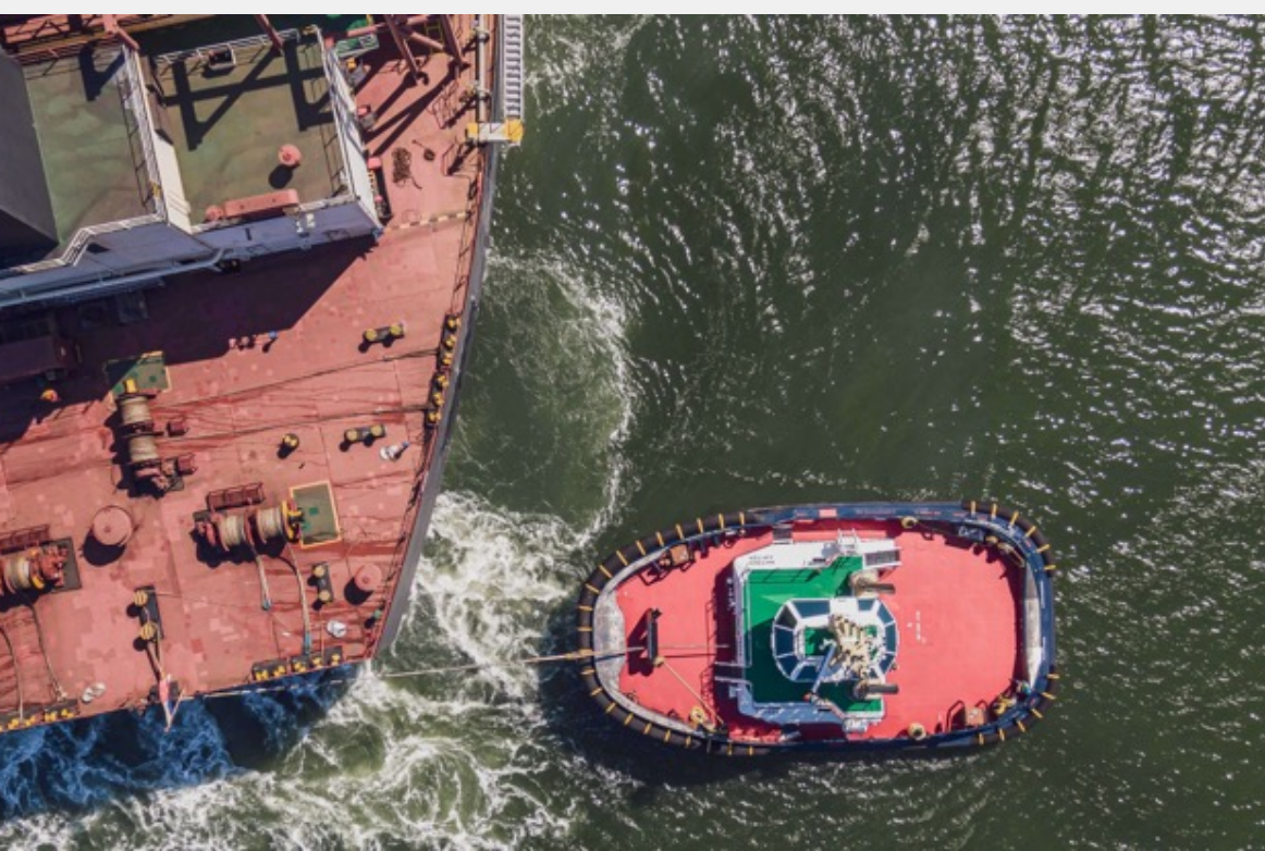
ASD Tug 2312 (2024)

CUSTOMER: Damen Shipyards Group TYPE: ASD Tug 2111 TYPE OF WORK: Newbuild SCOPE OF SUPPLY: Switchboard package & consoles