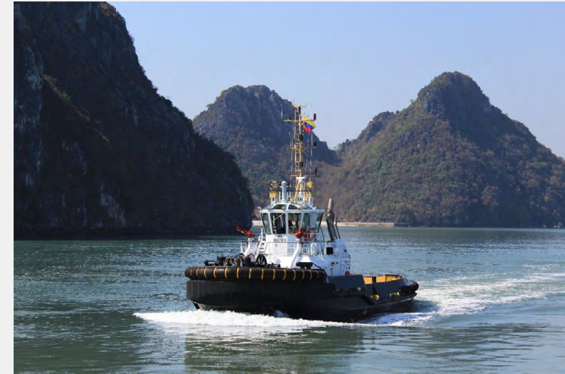
ASD Tug 2312, ASD Tug 2111 and RSD Tug 2513 (2025)

CUSTOMER: Damen Shipyards Group TYPE: RSD Tug 2513 Electric TYPE OF WORK: Newbuild SCOPE OF SUPPLY: Switchboards and consoles delivery