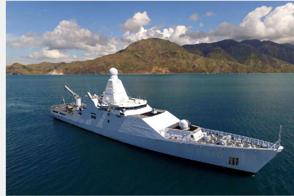
Zr.Ms. Holland (2012)

CUSTOMER: Damen Naval TYPE: Ocean-going Patrol Vessel (108.4 m) TYPE OF WORK: Newbuild SCOPE OF SUPPLY: Complete electrical systems integration, installing, supervising on site and commissioning.