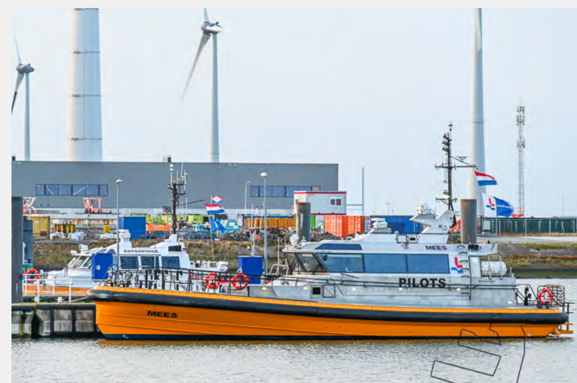
Mare - Mees - Maud - Milo (2025)

CUSTOMER: Neptune Marine TYPE: Crew Transfer Vessel TYPE OF WORK: Newbuild SCOPE OF SUPPLY: Engineering, installation and commissioning of complete electrical installation, including alarm, monitoring and control systems, power management system, electrical distribution systems.