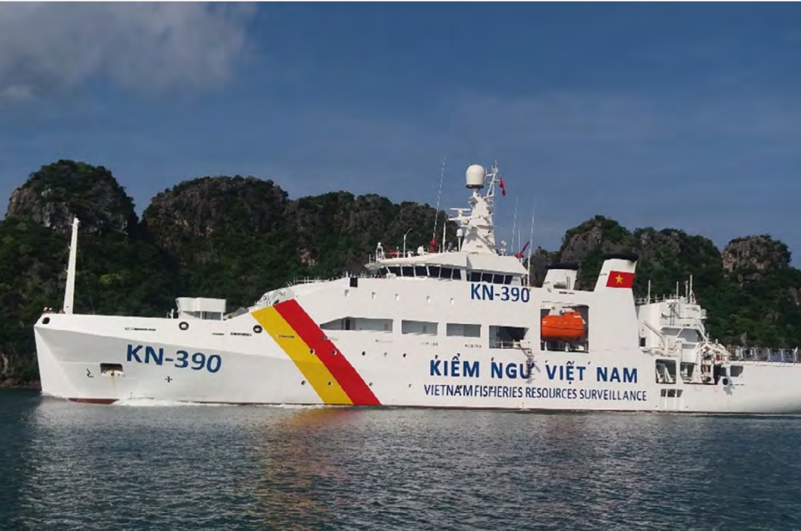
Fishery control vessel KN390 (2025)

CUSTOMER: Damen Shipyards Group TYPE: Coast guard vessel TYPE OF WORK: Newbuild SCOPE OF SUPPLY: Full package of electric and alarm/monitoring system