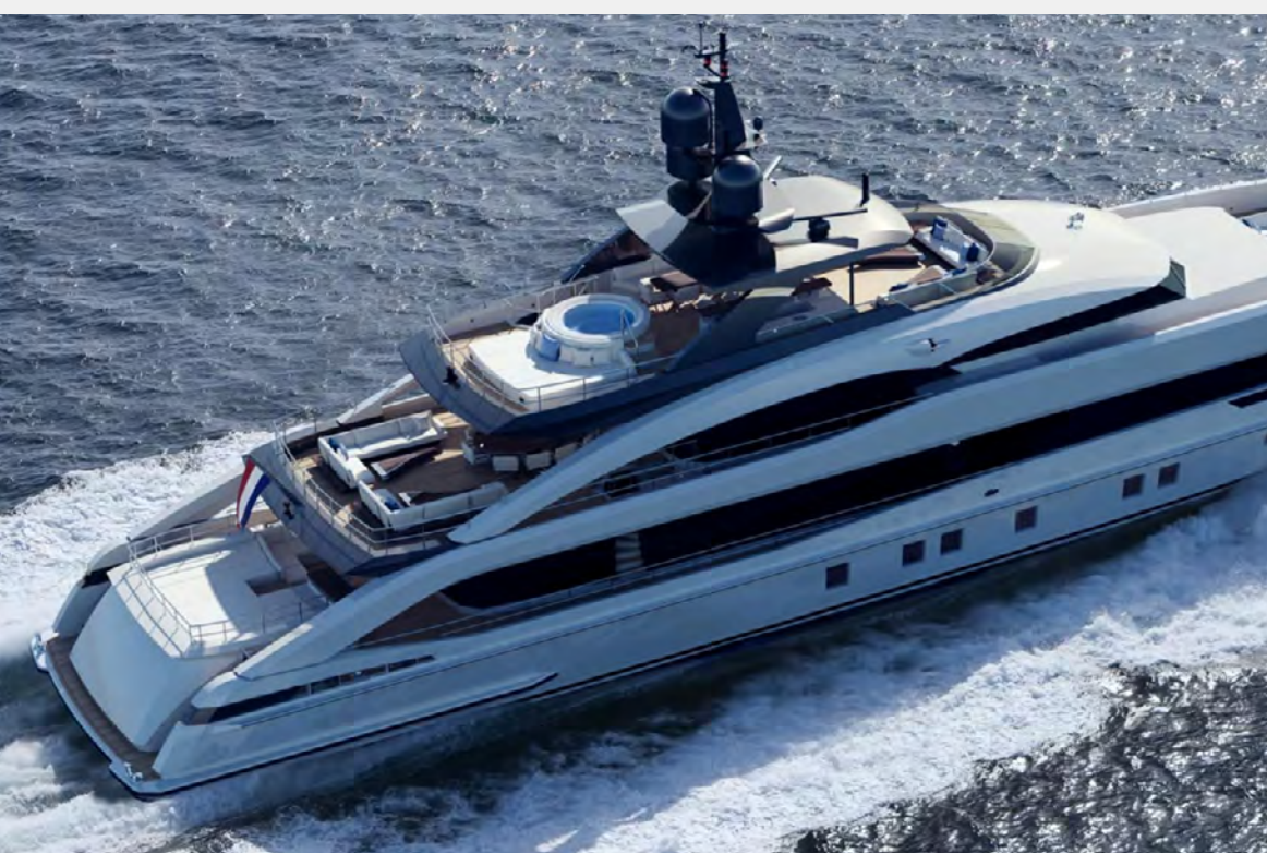
Aquamarine 18950 (2021)

CUSTOMER: Baltic Yachts TYPE: Sailing Yacht TYPE OF WORK: Newbuild SCOPE OF SUPPLY: NavCom, GMDSS system, Navigation package