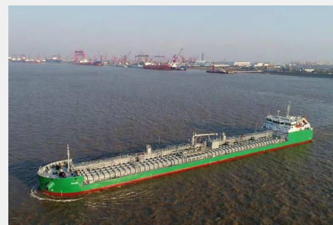
Maaike and Linda (2018)

CUSTOMER: Piriou France TYPE: Tuna vessel (67m) TYPE OF WORK: Newbuild SCOPE OF SUPPLY: Main Switchboard