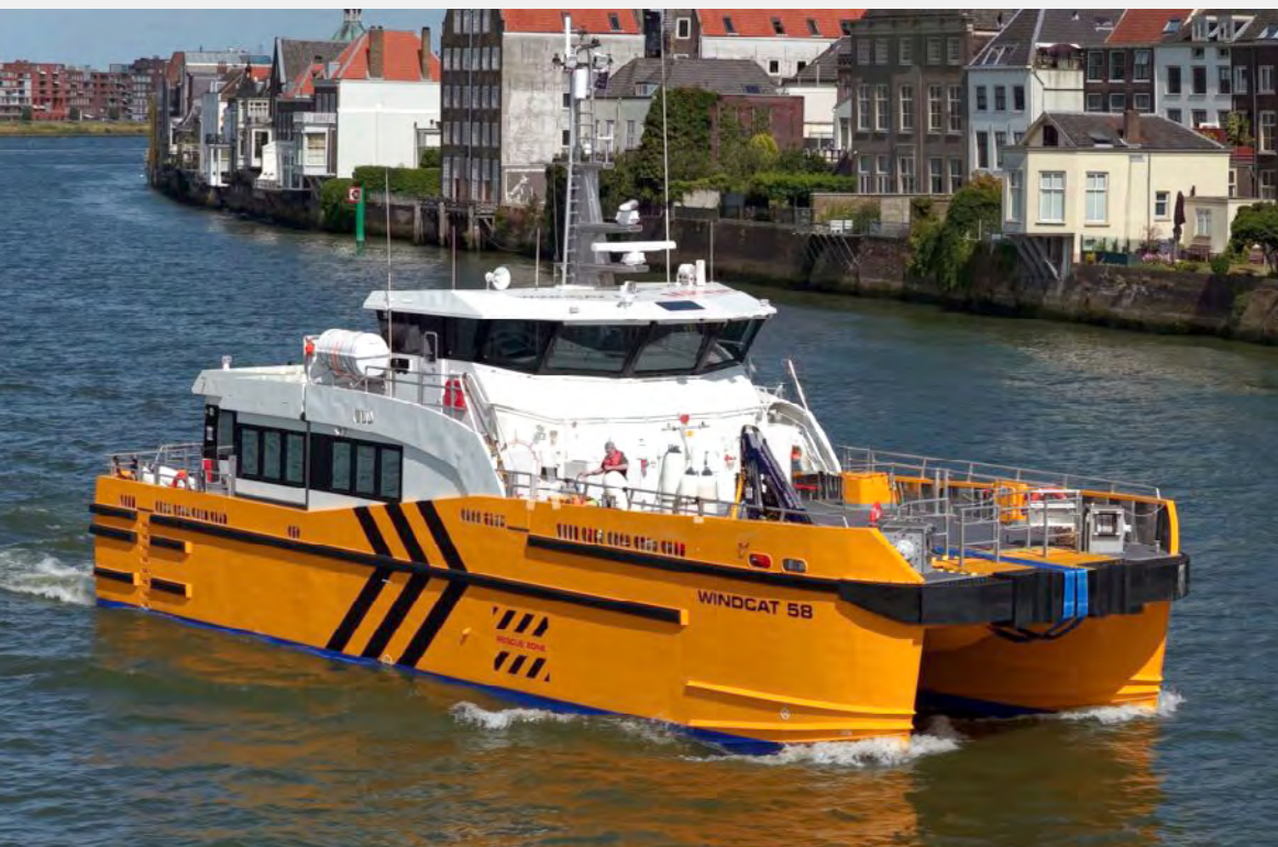
Windcat 58 (2025)

CUSTOMER: Dok en Scheepsbouw Woudsend TYPE: Crew Transfer Vessel TYPE OF WORK: Newbuild SCOPE OF SUPPLY: Engineering, installation and commissioning of complete electrical installation, including alarm, monitoring and control systems, power management system, electrical distribution systems.