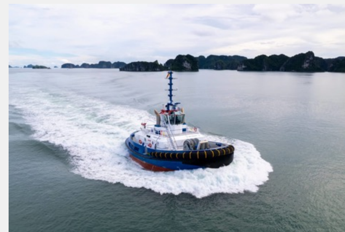
RSD Tug 2513 (2024)

CUSTOMER: Damen Shipyards Group TYPE: ASD Tug 2312 TYPE OF WORK: Newbuild SCOPE OF SUPPLY: Switchboard package & consoles