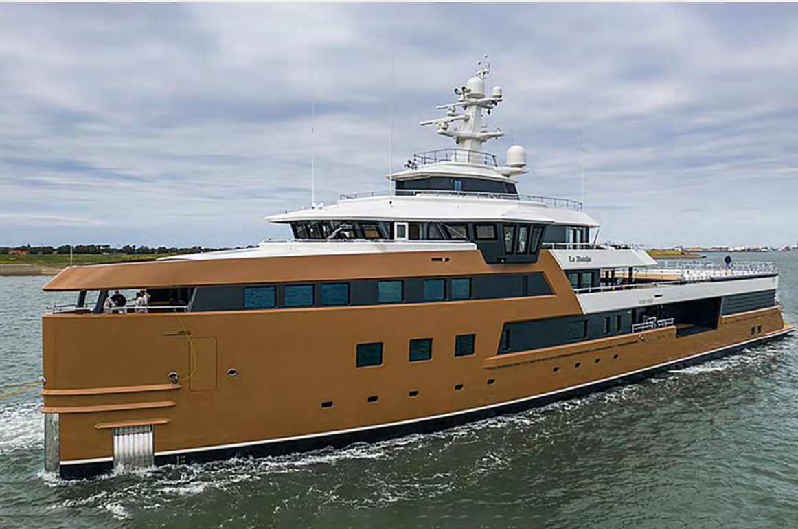
La Datcha (2020)

CUSTOMER: Damen Yachting TYPE: Expedition Yacht (77 m) TYPE OF WORK: Newbuild SCOPE OF SUPPLY: Entertainment system, IT and CCTV system.