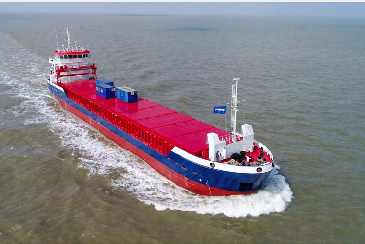
Sophie & Benabell G. YN 559012-13 (2021)

CUSTOMER: Damen Shipyards Gorinchem, Yichang TYPE: Liquified Gas Carrier (LGC) 6000 LNG s, Bunkering vessel (100 m) TYPE OF WORK: Newbuild SCOPE OF SUPPLY: Electrical Engineering and Integration, Equipment delivery, Supply and supervising of loose equipment and cables, Commissioning.