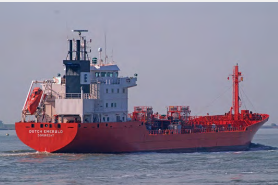
Dutch Emerald (2000)

CUSTOMER: VEKA Shipyard Lemmer TYPE: chemical tanker TYPE OF WORK: Newbuild SCOPE OF SUPPLY: Engineering, installation and commissioning of complete electrical installation, including alarm, monitoring and control systems, electrical distribution systems.