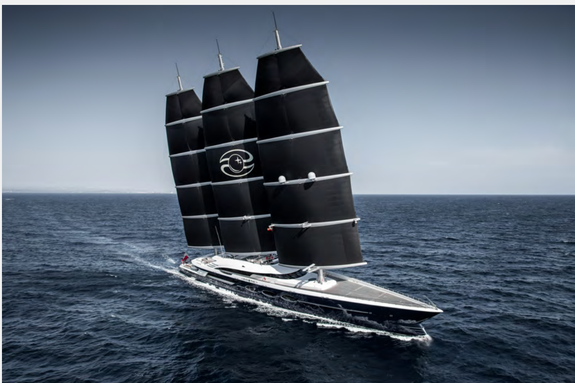
Black Pearl (2018)

CUSTOMER: Oceanco TYPE: Motor Yacht (109 m) TYPE OF WORK: Newbuild SCOPE OF SUPPLY: System integration and complete electrical installation, IT systems, hybrid system, AMCS.