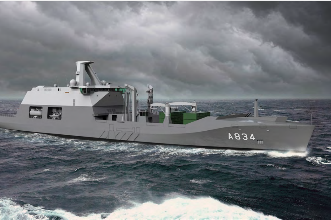
CSS Den Helder (2024)

CUSTOMER: Damen Naval TYPE: Combat Support Ship TYPE OF WORK: Newbuild SCOPE OF SUPPLY: Electrical installation activities, including of the military equipment