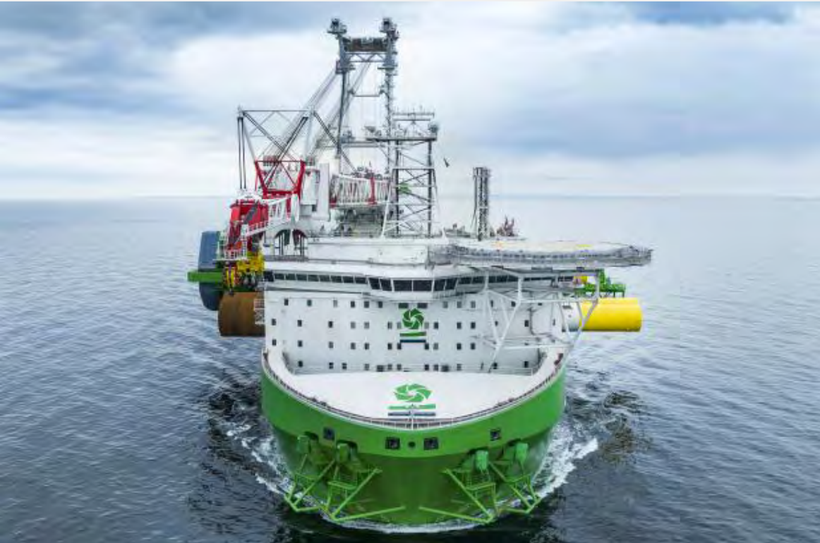
DEME Sea Installer (2023)

CUSTOMER: Damen Shiprepair Rotterdam TYPE: Oceanographic Survey Vessel (85.3 m) TYPE OF WORK: Refit SCOPE OF SUPPLY: Electrical outfitting, update DP (dp 2), upgrade bridge system, farsounder, panels, shore connection, lighting system (lutron/pharos), pulling and terminating 205km cables.