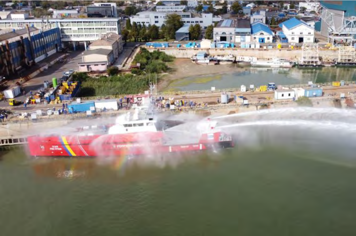
Stan Patrol 5009 (2x) (2023)

CUSTOMER: Damen Naval TYPE: Patrol vessel TYPE OF WORK: Conversion SCOPE OF SUPPLY: E-package: engineering, supervision of installing, commissioning