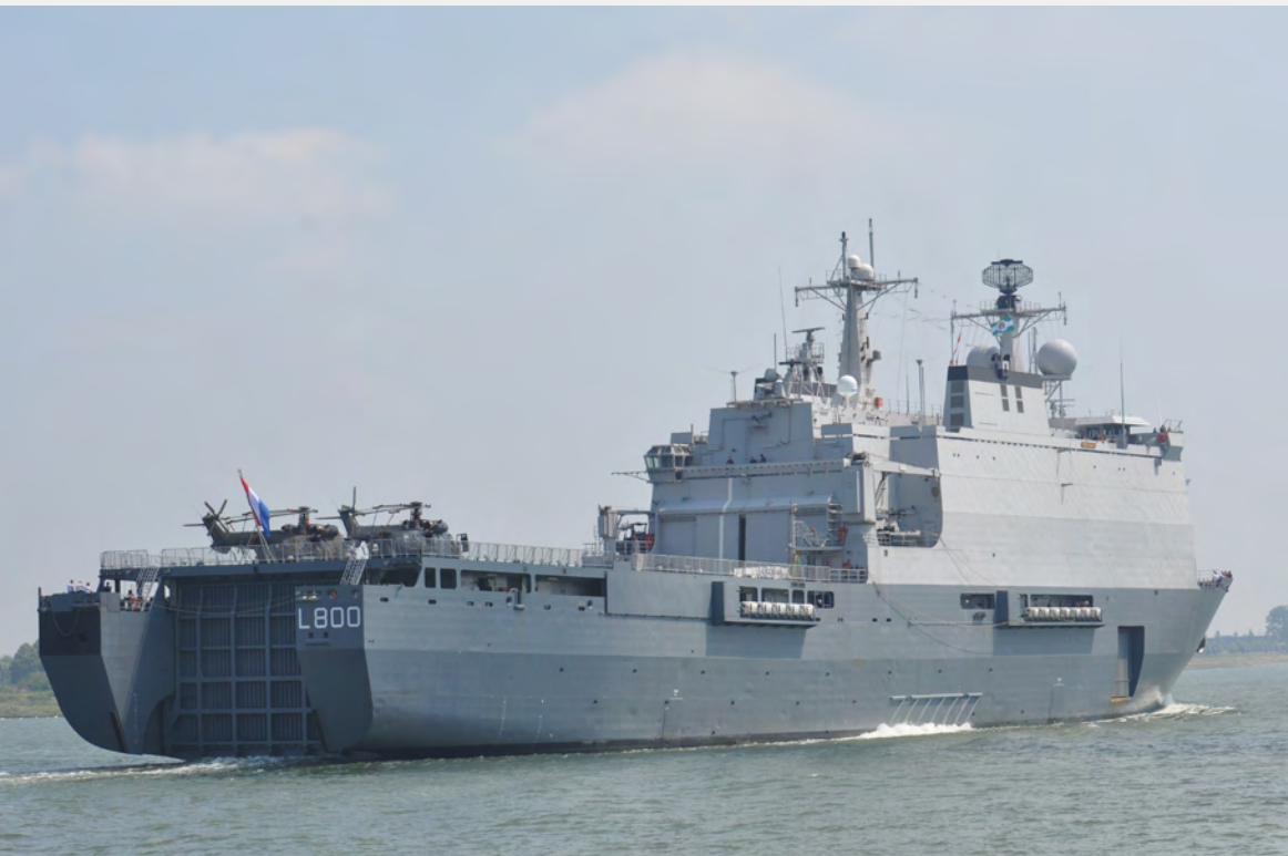
Zr.Ms. Rotterdam (2019)

CUSTOMER: DMI TYPE: Landing Platform Dock (166 m) TYPE OF WORK: Refit SCOPE OF SUPPLY: Modification electric installation hospital.