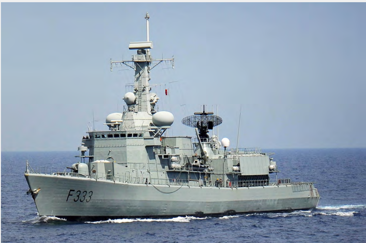
N.R.P. Bartolomeu Dias (F333) and N.R.P. Don Francisco de Almeida (F334) (2021)

CUSTOMER: Damen Naval TYPE: ASRV Icebreaker, Research vessel (160 m) TYPE OF WORK: Newbuild SCOPE OF SUPPLY: Electrical Engineering and Integration, Equipment delivery, Supply and Installation of loose equipment and cables.