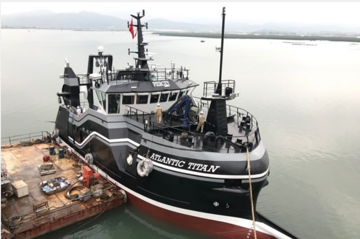
Atlantic Titan - Fishing trawler 30m (2019)

CUSTOMER: Damen Shipyards Gorinchem, Yichang TYPE: Combi Freighter 3850 - multipurpose carriers (90 m) TYPE OF WORK: Newbuild SCOPE OF SUPPLY: Complete electrical engineering, cables & equipment delivery and commissioning works for: power generation and power distribution system, motor starters, alarm monitoring and control system, fire detection system, public address system, telephone system, etc.