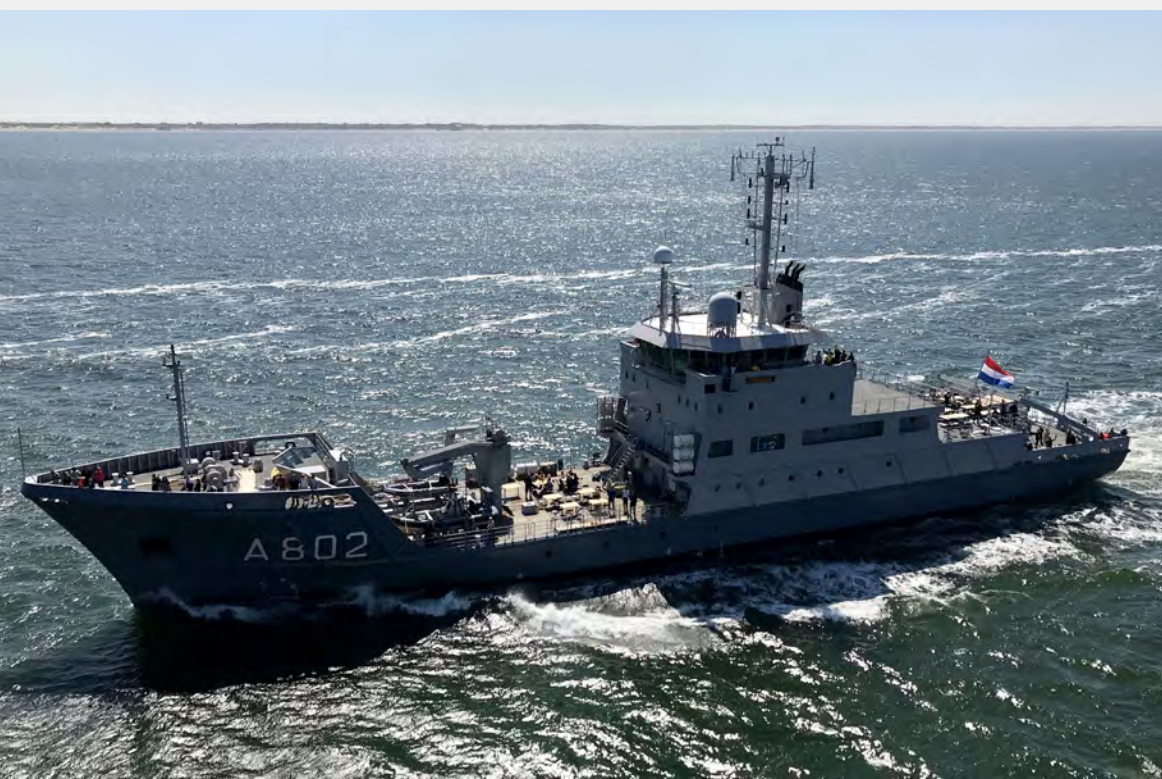
Zr.Ms. Snellius (2020)

CUSTOMER: Damen Shipyards Den Helder TYPE: Naval Auxiliary Vessel (65 m) TYPE OF WORK: Refit SCOPE OF SUPPLY: Mid-Life upgrade and maintenance.