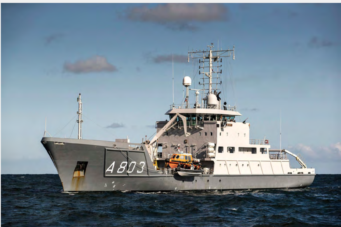
Zr.Ms. Luymes (2020)

CUSTOMER: R+S TYPE: Hydrografic Research Vessel (80 m) TYPE OF WORK: Refit SCOPE OF SUPPLY: Modifications PABX.