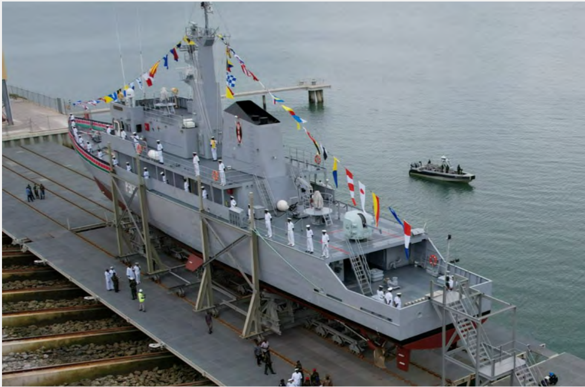
KNS Shupavu (2024)

CUSTOMER: Damen Naval TYPE: Combat Support Ship TYPE OF WORK: Newbuild SCOPE OF SUPPLY: Electrical installation activities, including of the military equipment