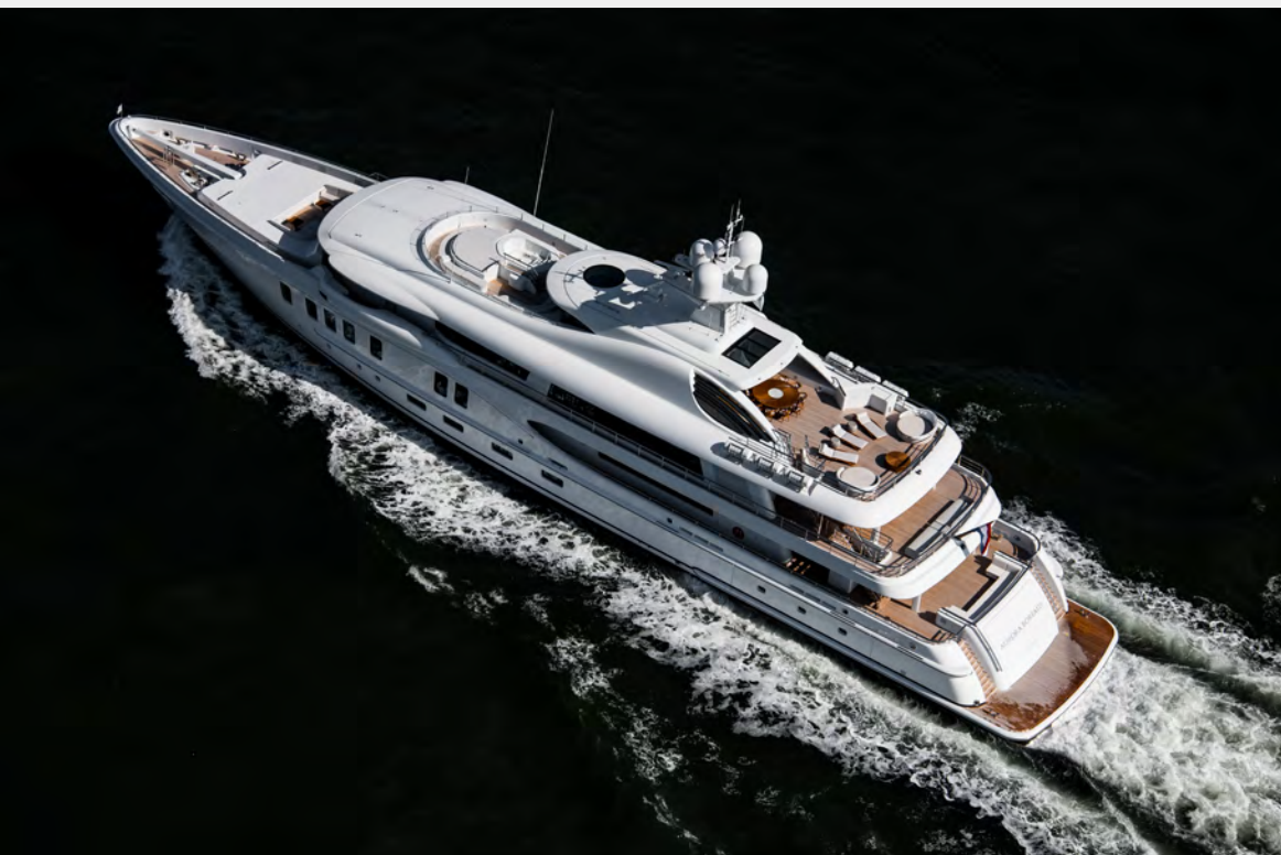
Amels 212 – Neninka (2019)

CUSTOMER: Amels TYPE: Motor Yacht (55 m) TYPE OF WORK: Newbuild SCOPE OF SUPPLY: System integration and complete electrical installation, navigation and communication system, alarm & monitoring system, AVIT system.