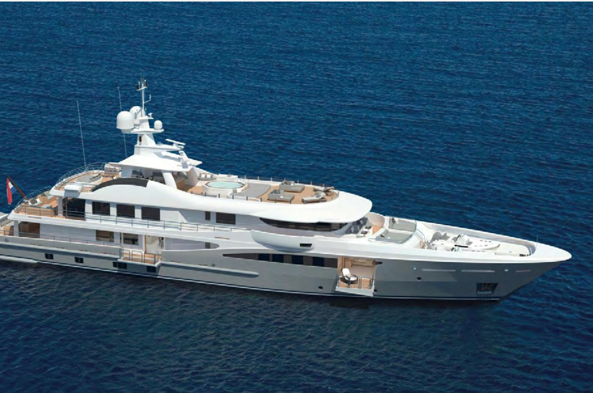
Amels 180 – PAPA (2019)

CUSTOMER: Amels TYPE: Motor Yacht (55 m) TYPE OF WORK: Newbuild SCOPE OF SUPPLY: System integration and complete electrical installation, navigation and communication system, alarm & monitoring system, AVIT system.