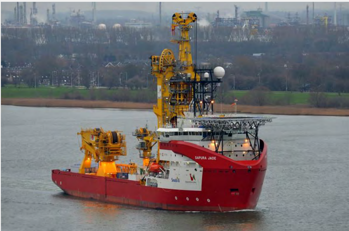
Sapura Jade (2016)

CUSTOMER: Damen Galați TYPE: Cable Layer (138 m) TYPE OF WORK: Newbuild SCOPE OF SUPPLY: System Integration, complete electrical installation; alarm, monitoring and control system; power distribution system.