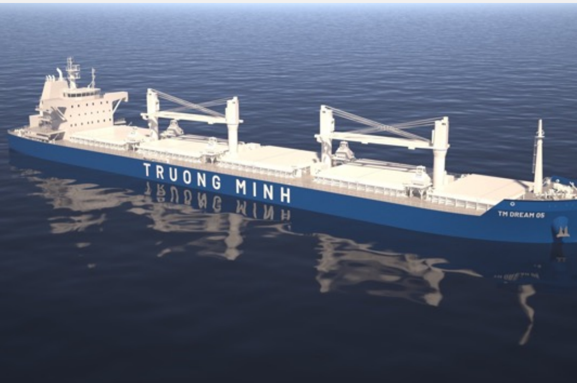
TM Dream 1 & 2 (2024)

CUSTOMER: Dong Bac shipbuilding company TYPE: bulk carrier 65,000DWT TYPE OF WORK: Newbuild SCOPE OF SUPPLY: Engineering all switchboards, switchboards package & AMS.