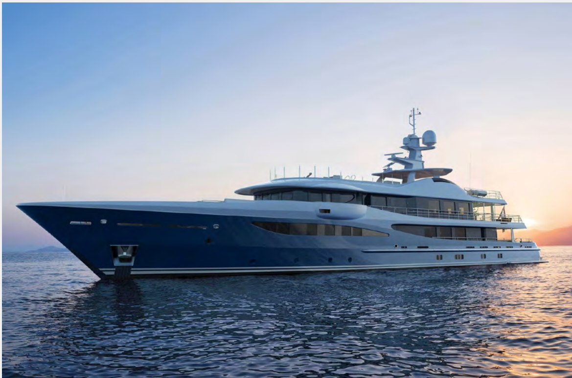
Amels 180 – Halo (2019)

CUSTOMER: Royal Huisman TYPE: Sailing Yacht (39 m) TYPE OF WORK: Refit SCOPE OF SUPPLY: Navigation- and Communication system.