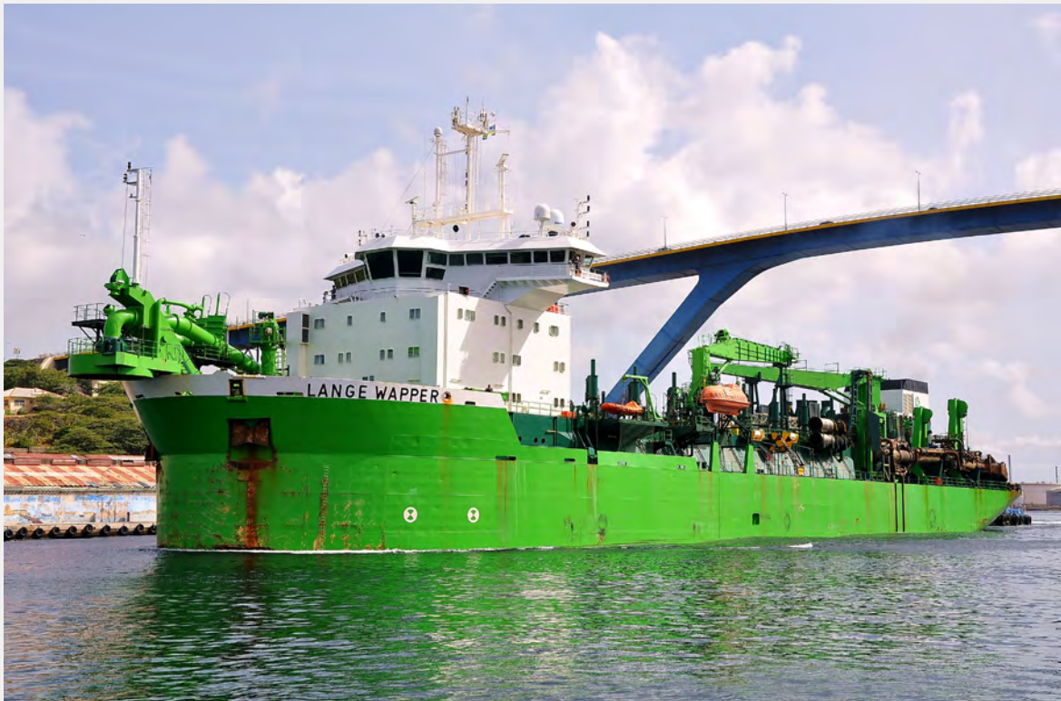
Lange Wapper (2019)

CUSTOMER: DEME TYPE: Trailing Suction Hopper Dredger (11796 m³) TYPE OF WORK: Refit SCOPE OF SUPPLY: Automation Systems.