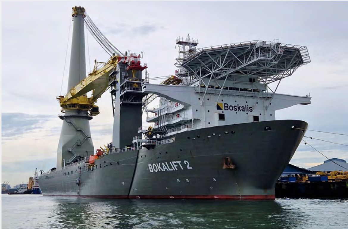
BOSKALIS Bokalift 2 (2023)

CUSTOMER: Huisman Equipment TYPE: Jack-up vessel TYPE OF WORK: Conversion SCOPE OF SUPPLY: Installation 1,600mt Leg Encircling Crane (LEC)