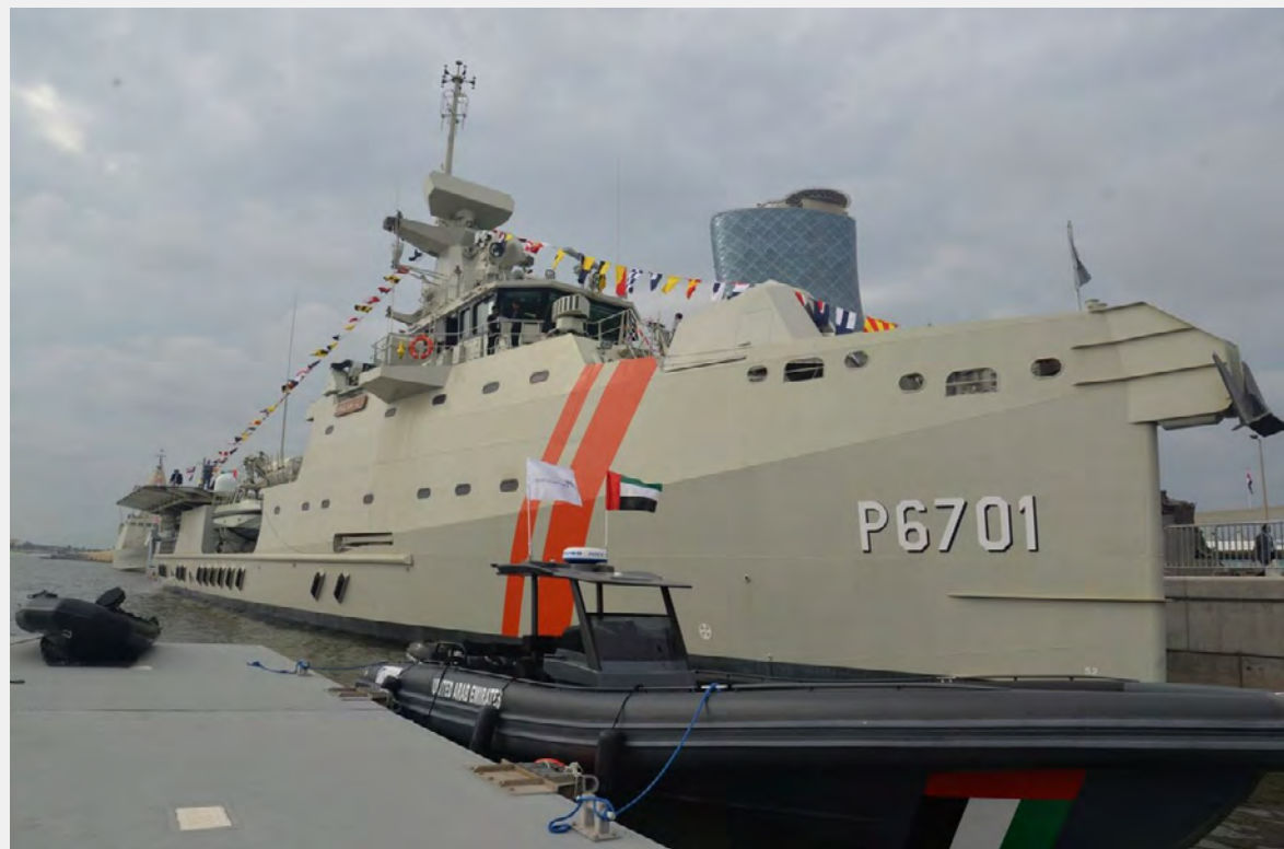
Hmeem/OPV 6711 UAE (2016)

CUSTOMER: Damen Shipyards Gorinchem TYPE: Offshore Patrol Vessel (67 m) TYPE OF WORK: Newbuild SCOPE OF SUPPLY: Electrical package delivery. Engineering, installing and commissioning.