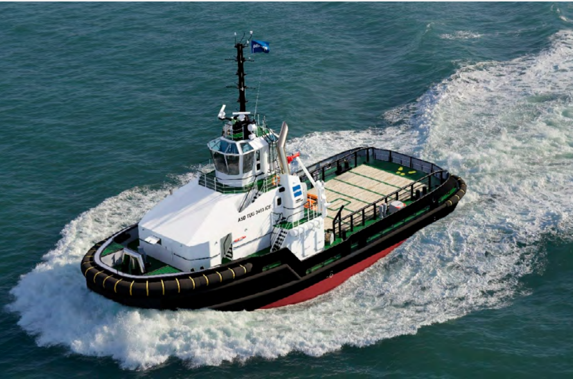
ASD Tug 3413 ICE (2021)

CUSTOMER: Damen Shipyards TYPE: Ice Tug(34 m) TYPE OF WORK: Newbuild SCOPE OF SUPPLY: Switchboards