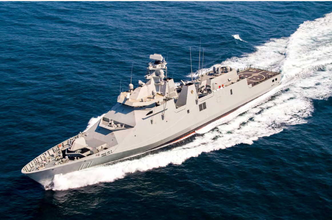
ARM Benito Juárez (2020)

CUSTOMER: Damen Shipyards Gorinchem TYPE: Offshore Patrol Vessel 1900 (90 m) TYPE OF WORK: Newbuild SCOPE OF SUPPLY: Electrical package delivery. Engineering, installing, commissioning and supervision.