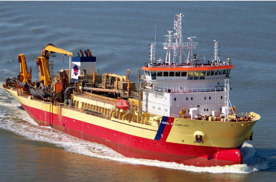
Samuel de Champlain (2018)

CUSTOMER: Damen Shiprepair Dunkerque TYPE: Trailing Suction Hopper Dredger (8500 m³) TYPE OF WORK: Refit SCOPE OF SUPPLY: Conversion to dual fuel. Power Management System (PMS) and IAS.