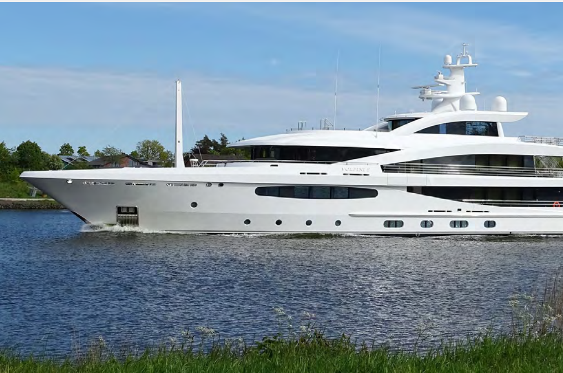
Amels 200 – Volpini 2 (2018)

CUSTOMER: Oceanco TYPE: Motor Yacht (90m) TYPE OF WORK: Newbuild SCOPE OF SUPPLY: Systems integration and complete electrical installation, AMCS.