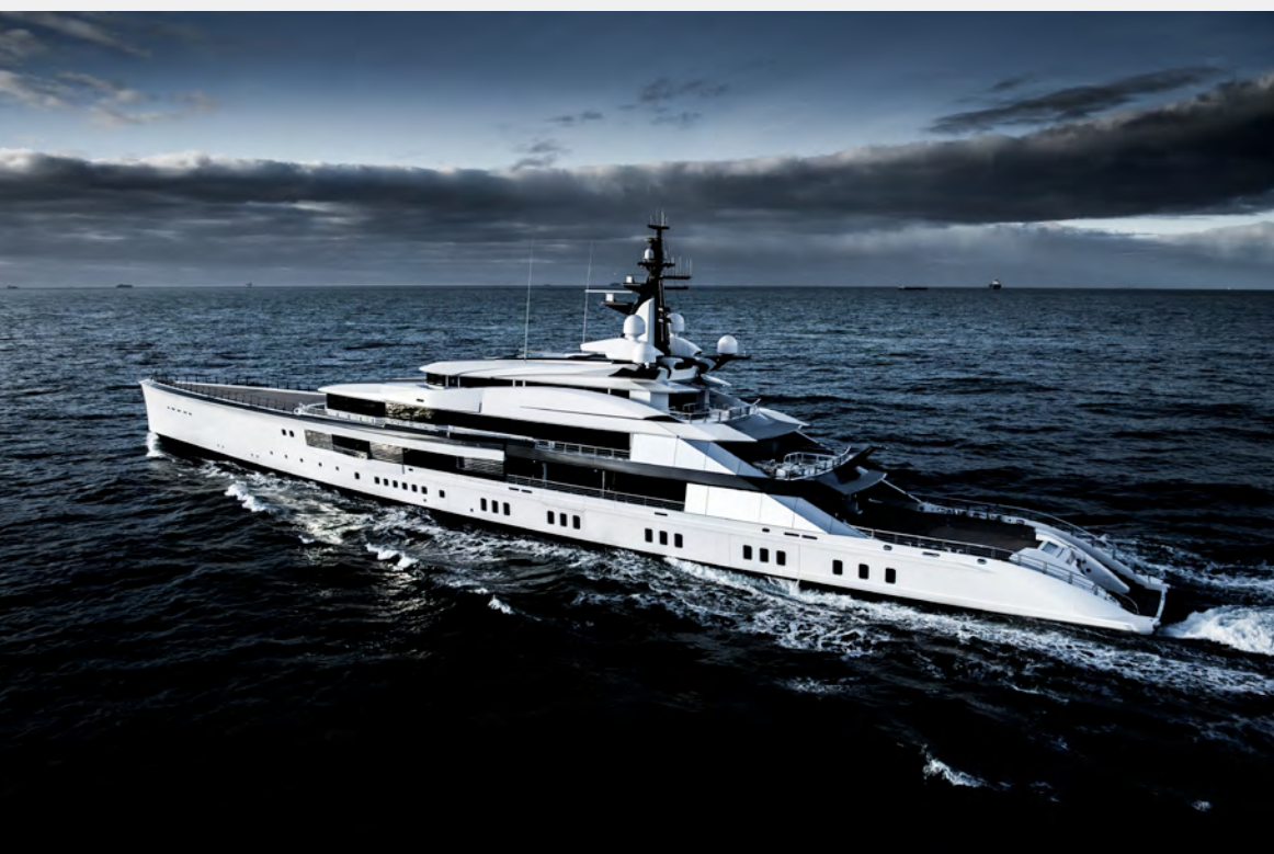
Bravo Eugenia (2018)

CUSTOMER: Oceanco TYPE: Motor Yacht (90 m) TYPE OF WORK: Newbuild SCOPE OF SUPPLY: System integration and complete electrical installation, IT systems, AMCS.