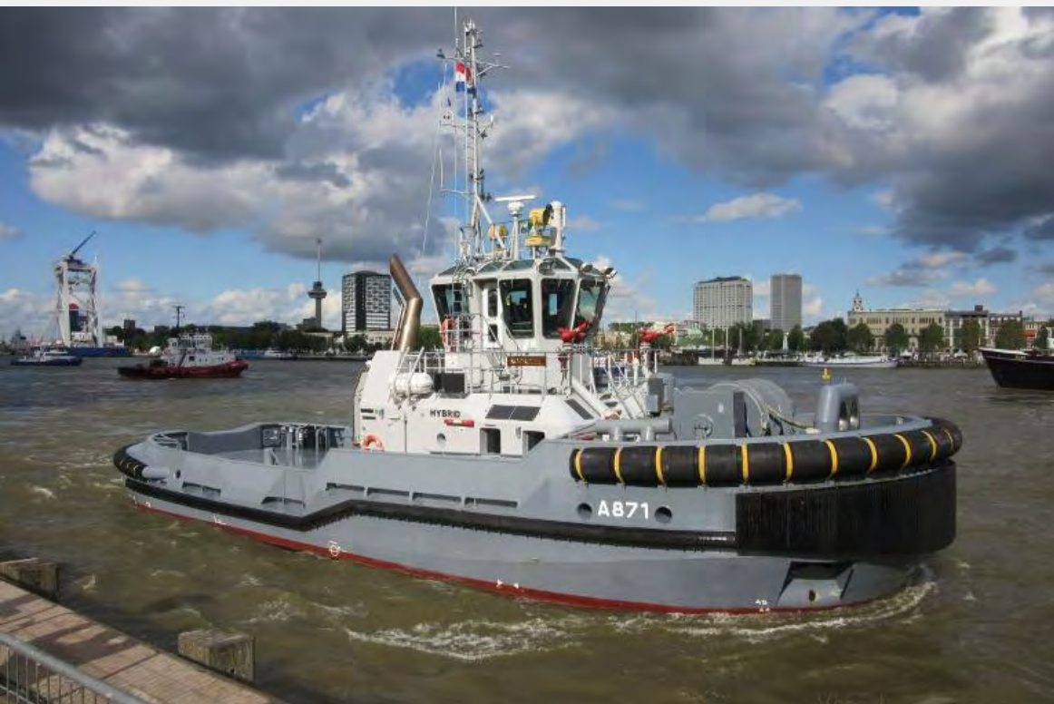
ASD Tug 2810 Hybrid (2018)

CUSTOMER: Damen Shipyards TYPE: Tugboat (24 m) TYPE OF WORK: Newbuild SCOPE OF SUPPLY: Infrastructure (Cable Routing, Cable Trays), Switchboards and Consoles.