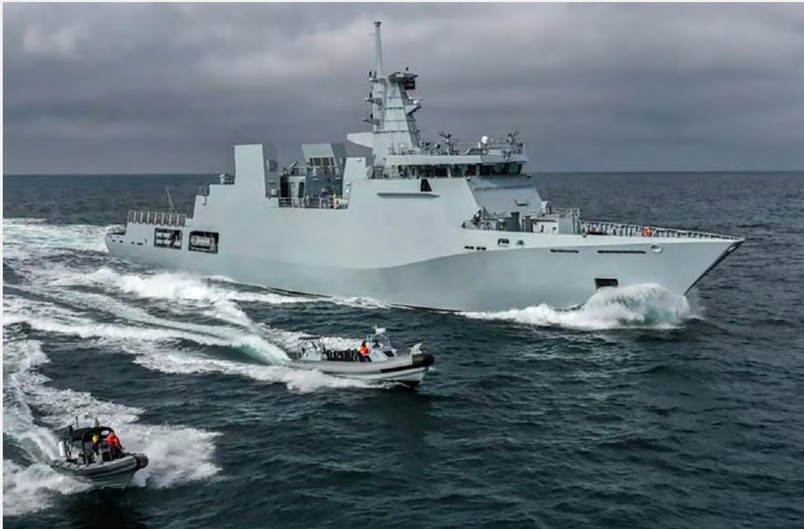
PNS Tabuk (2020)

CUSTOMER: Damen Shipyards Gorinchem TYPE: Offshore Patrol Vessel 1900 (90 m) TYPE OF WORK: Newbuild SCOPE OF SUPPLY: Electrical package delivery. Engineering, installing, commissioning and supervision.