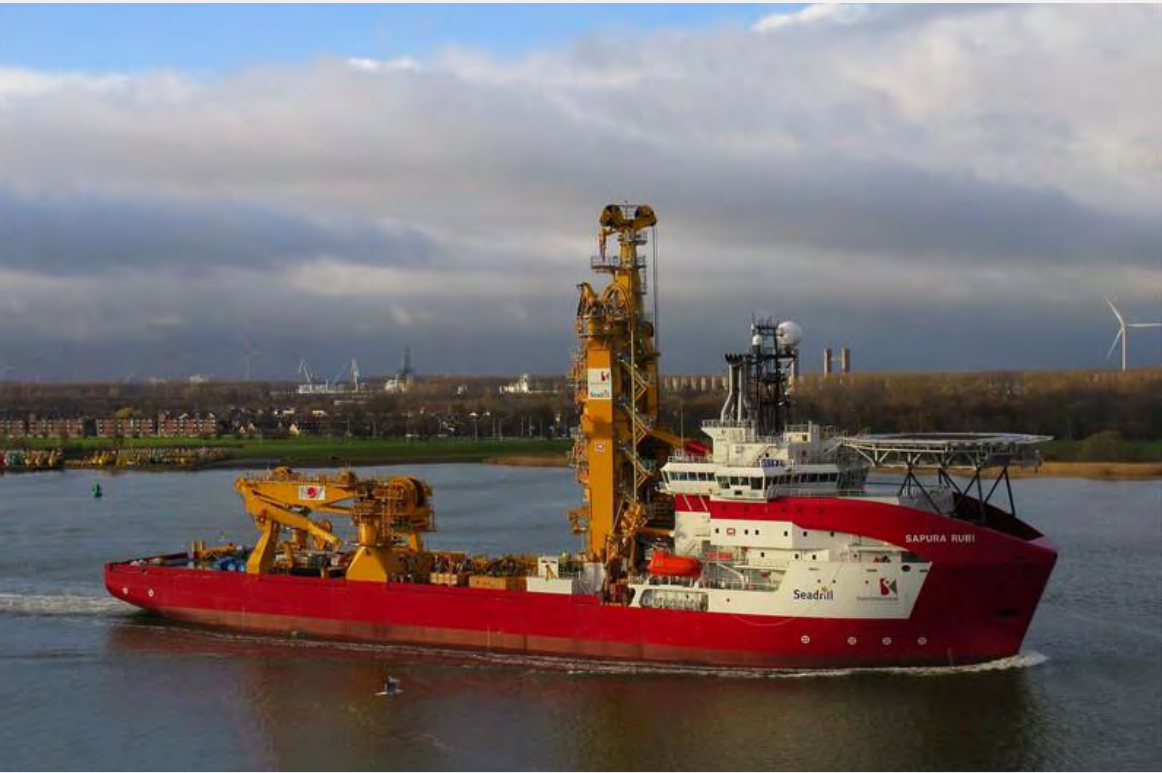
Sapura Rubi (2016)

CUSTOMER: IHC Offshore & Marine TYPE: Pipe Laying Support Vessel (145.9 m) TYPE OF WORK: Newbuild SCOPE OF SUPPLY: System Integration, complete electrical installation.