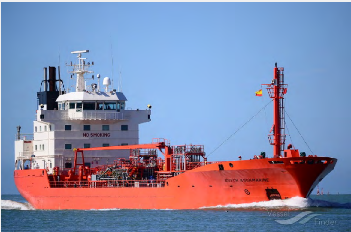
Dutch Aqua Marine (2000)

CUSTOMER: VEKA Shipyard Lemmer TYPE: Chemical oil product tanker TYPE OF WORK: Newbuild SCOPE OF SUPPLY: Engineering, installation and commissioning of complete electrical installation, including alarm, monitoring and control systems, electrical distribution systems, power management system.