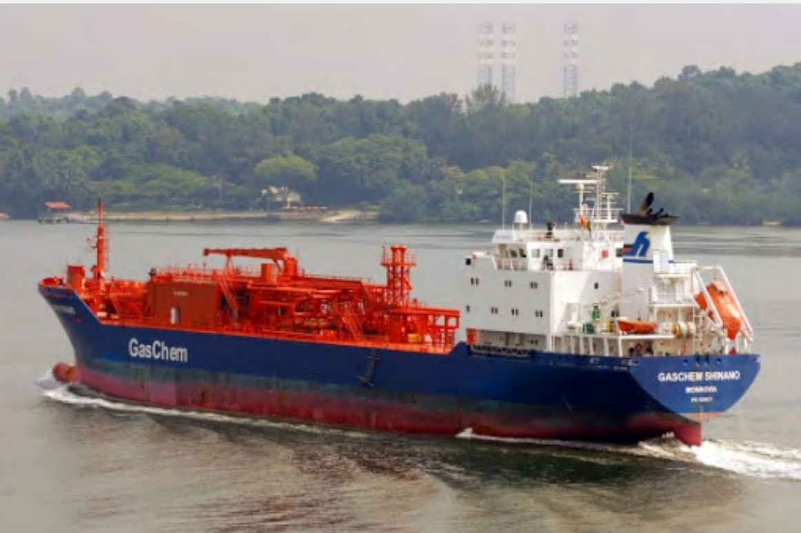
GasChem Shinano, Mosel, Leda, Rhone, Werra, Balti, Atlanti, Arcti, Caribic (2021)

CUSTOMER: Dong Bac shipbuilding company TYPE: bulk carrier 65,000DWT TYPE OF WORK: Newbuild SCOPE OF SUPPLY: Engineering all switchboards, switchboards package & AMS.