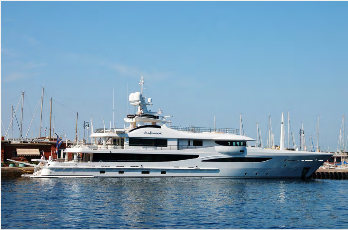
Amels 180 - Driftwood (2017)

CUSTOMER: Oceanco TYPE: Motor yacht (110 m) TYPE OF WORK: Newbuild SCOPE OF SUPPLY: System integration and complete electrical installation, IT systems and navigation and communication system.