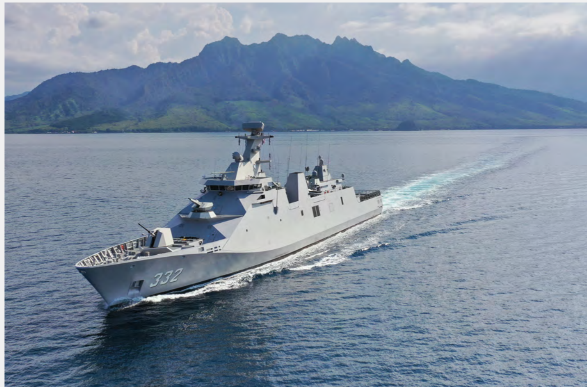
KRI I Gusti Ngurah Rai (2017)

CUSTOMER: Damen Naval TYPE: Guided-missile Frigate (105.1 m) TYPE OF WORK: Newbuild SCOPE OF SUPPLY: Engineering and integration of platform system, materials and equipment/system delivery, installing of cable and set to work activities.