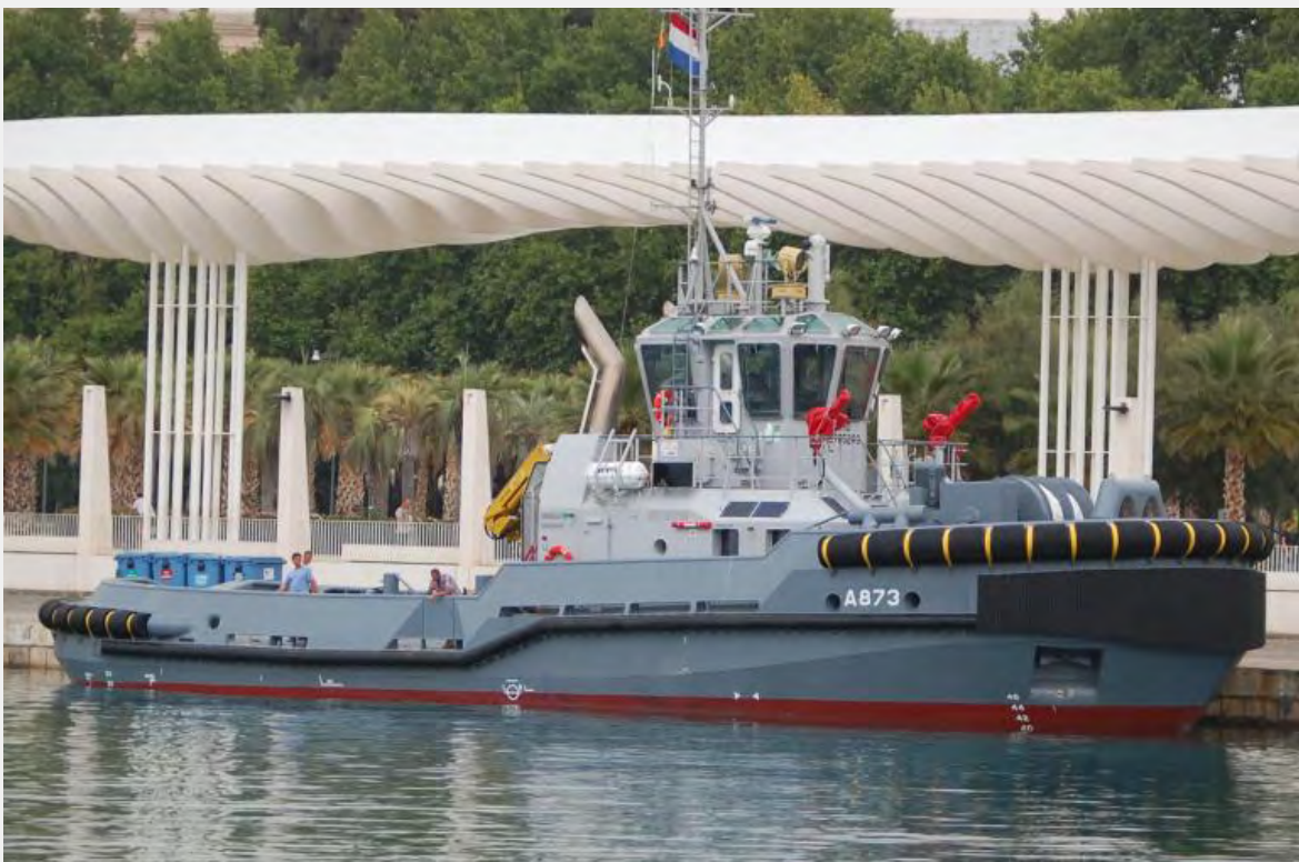
ASD Tug 2810 Hybrid (2018)

CUSTOMER: Damen Shipyards TYPE: Hybrid Tugboat (28 m) TYPE OF WORK: Newbuild SCOPE OF SUPPLY: Infrastructure (Cable Routing, Cable Trays), Switchboards and Consoles.