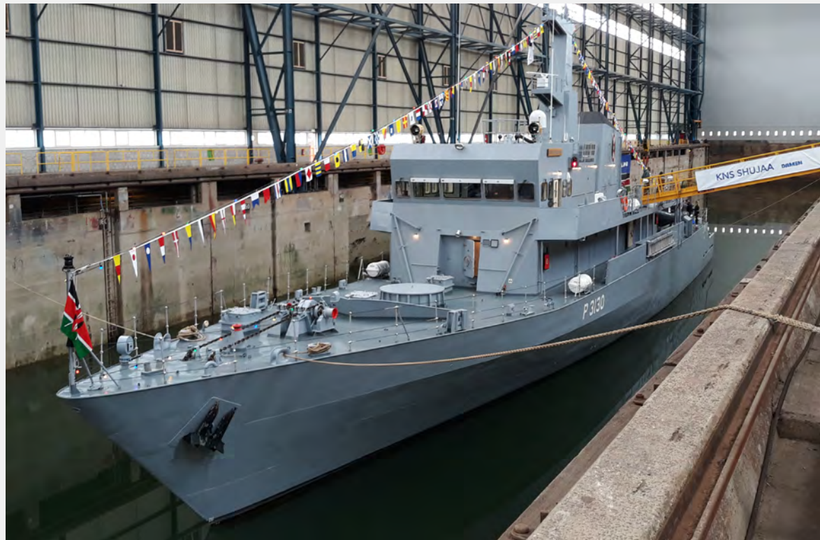
KNS Shujaa (2018)

CUSTOMER: DMI TYPE: Landing Platform Dock (166 m) TYPE OF WORK: Refit SCOPE OF SUPPLY: Modification electric installation hospital.