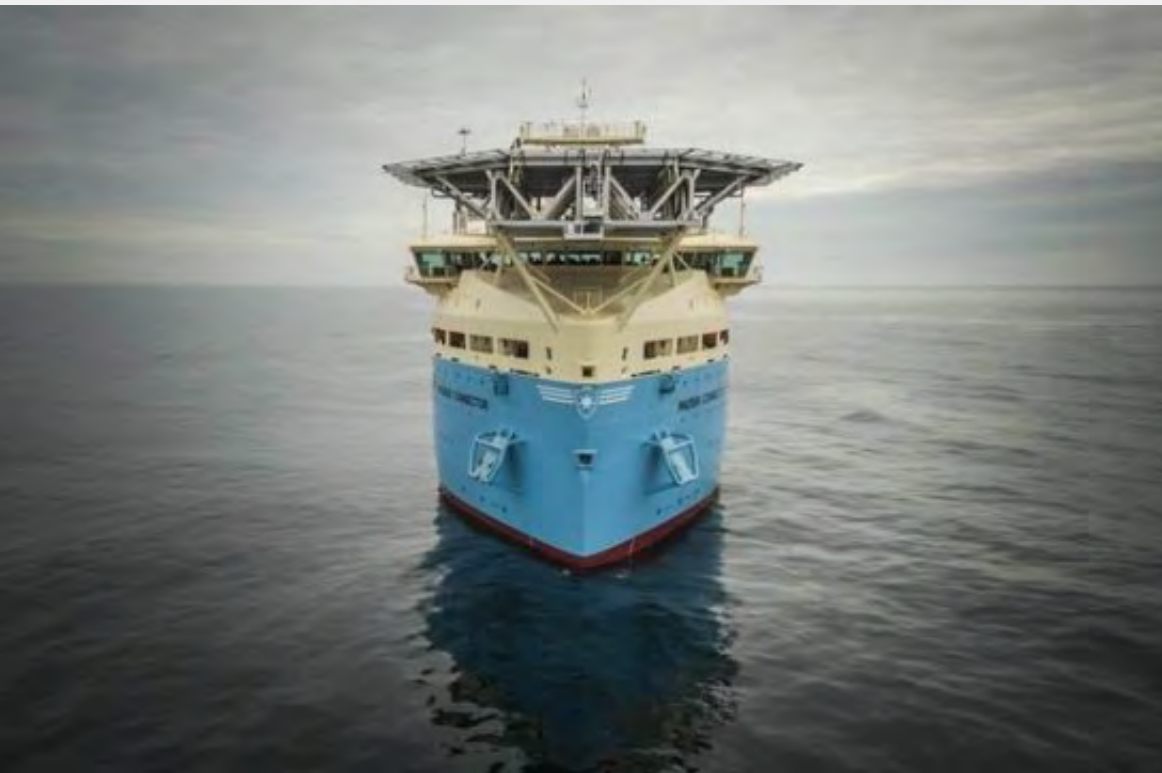
Maersk Connector (2016)

CUSTOMER: Damen Galați TYPE: Cable Layer (138 m) TYPE OF WORK: Newbuild SCOPE OF SUPPLY: System Integration, complete electrical installation; alarm, monitoring and control system; power distribution system.