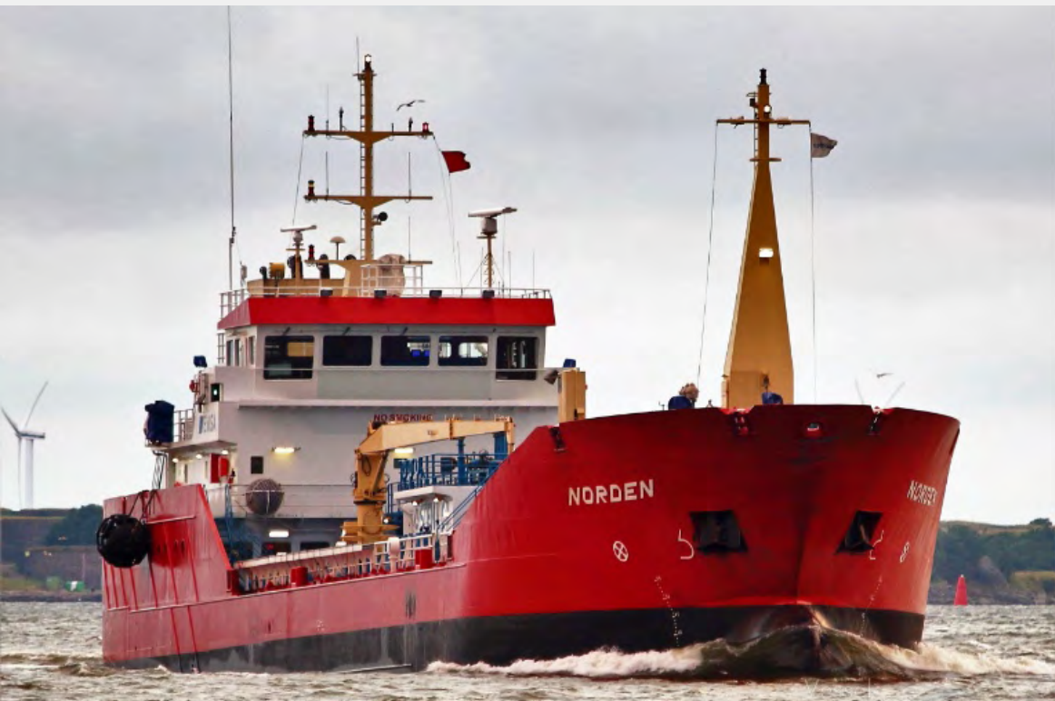
MT Norden (2006)

CUSTOMER: Bodewes Shipyards Hoogezand TYPE: 2.850 m³ oil tanker TYPE OF WORK: Newbuild SCOPE OF SUPPLY: Engineering, installation and commissioning of complete electrical installation, including alarm, monitoring and control systems, electrical distribution systems.