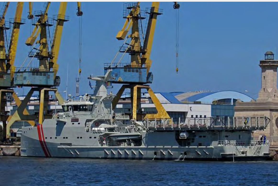
Arialah/OPV 6711 UAE (2016)

CUSTOMER: Damen Naval TYPE: Guided-missile Frigate (105.1 m) TYPE OF WORK: Newbuild SCOPE OF SUPPLY: Engineering and integration of platform system, materials and equipment/system delivery, installing of cable and set to work activities.