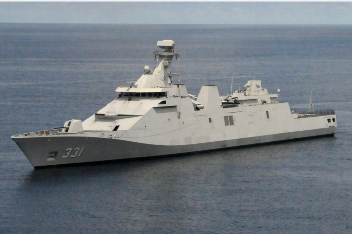
KRI Raden Eddy Martadinata (2017)

CUSTOMER: Damen Shiprepair Vlissingen TYPE: Research Vessel (60 m) TYPE OF WORK: Refit SCOPE OF SUPPLY: Life time extension. Electrical Installation and Nautical System.