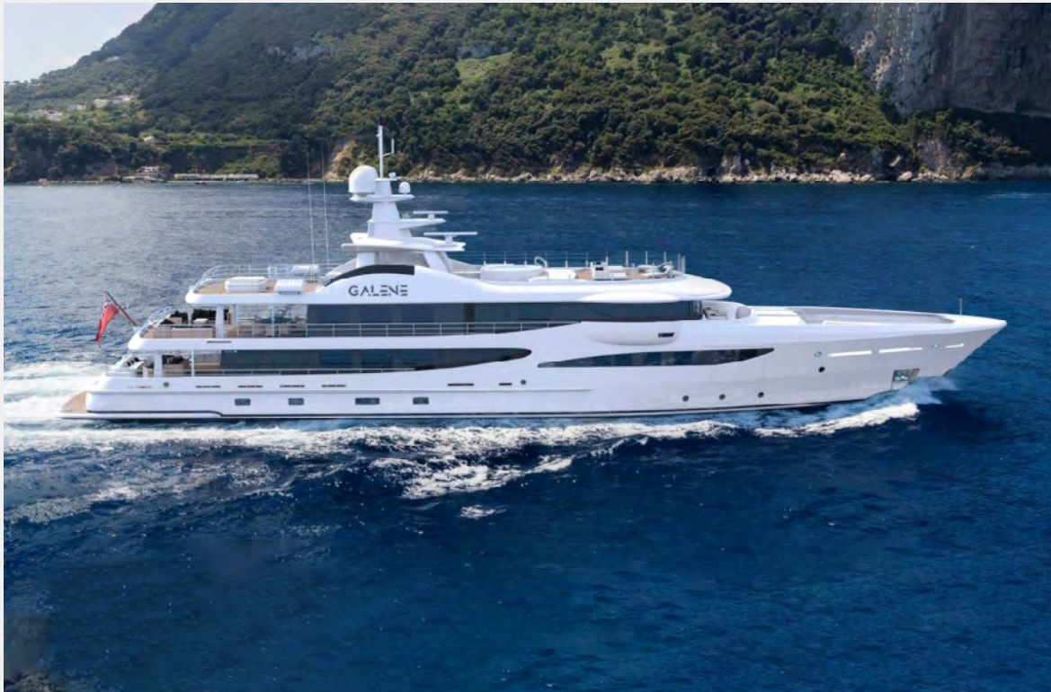
Amels 180 – Galene (2020)

CUSTOMER: Damen Yachting TYPE: Expedition Yacht (77 m) TYPE OF WORK: Newbuild SCOPE OF SUPPLY: Entertainment system, IT and CCTV system.