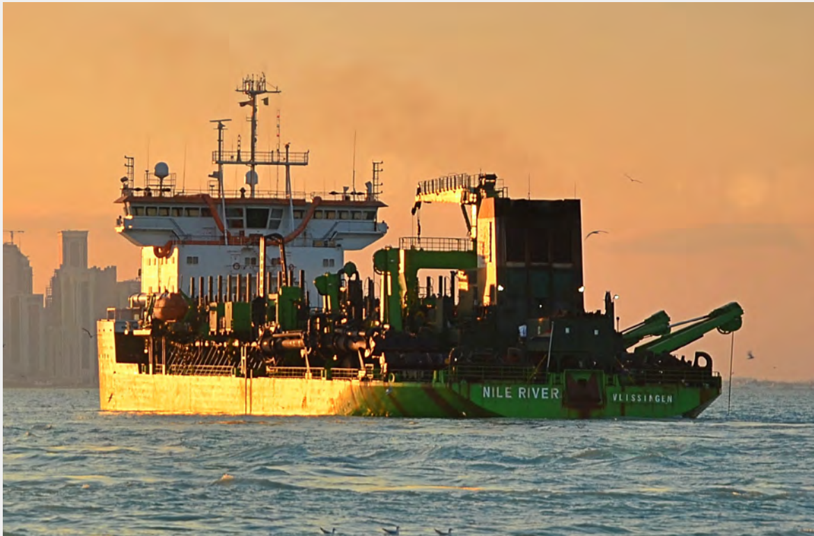
Nile River (2019)

CUSTOMER: DEME TYPE: Trailing Suction Hopper Dredger (3300 m³) TYPE OF WORK: Refit SCOPE OF SUPPLY: Alewijnse Draught and Loading System (ADLS), Alewijnse Suction Tube System (ASTS).