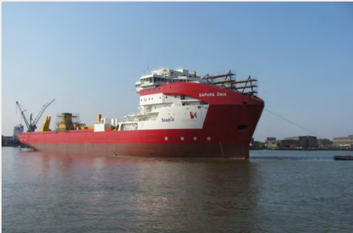
Sapura Onix (2015)

CUSTOMER: IHC Offshore & Marine TYPE: Pipe Laying Support Vessel (145 m) TYPE OF WORK: Newbuild SCOPE OF SUPPLY: System Integration, complete electrical installation.