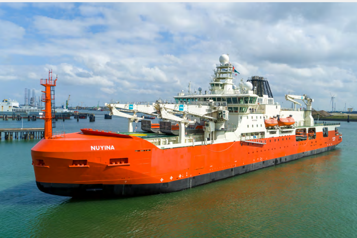
Nuyina, YN 417000 (2021)

CUSTOMER: Damen Naval TYPE: Ocean Patrol Vessel TYPE OF WORK: Newbuild SCOPE OF SUPPLY: E-package