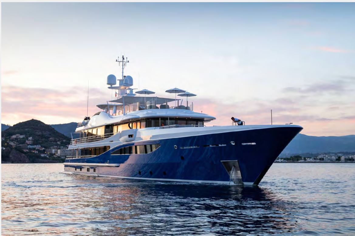
Amels 180 – Nomad (2019)

CUSTOMER: Amels TYPE: Motor Yacht (67 m) TYPE OF WORK: Newbuild SCOPE OF SUPPLY: Navigation and communication system.