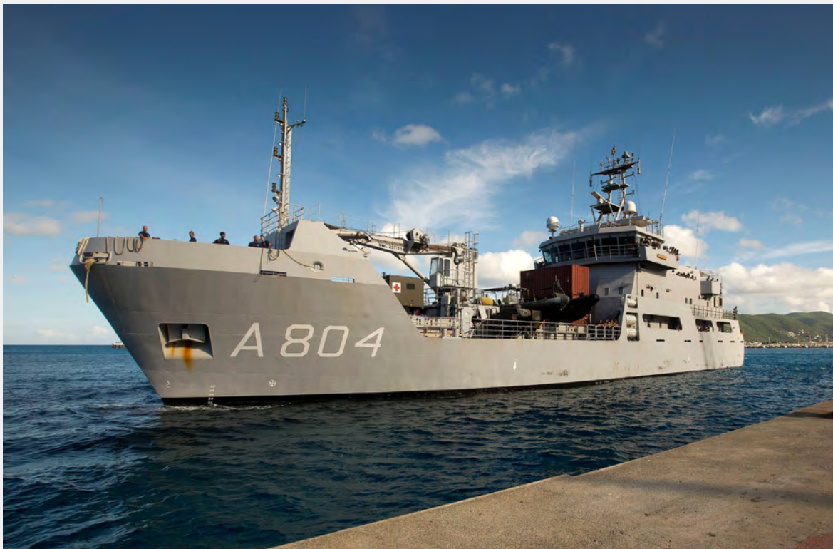
Zr.Ms. Pelikaan (2020)

CUSTOMER: Damen Naval TYPE: Long Range Oceanic Patrol Vessel (107.5 m) TYPE OF WORK: Newbuild SCOPE OF SUPPLY: Complete electrical systems integration, installing, supervising on site and commissioning.