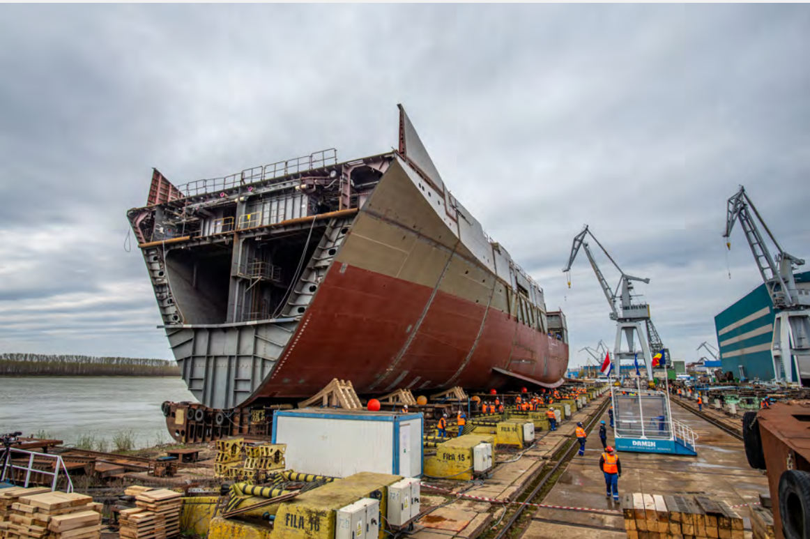
Modular Dry Dock MFDd21036 (2023)

CUSTOMER: Huisman Equipment TYPE: Crane ship TYPE OF WORK: Conversion SCOPE OF SUPPLY: Installation Motion Compensated Pile Gripper