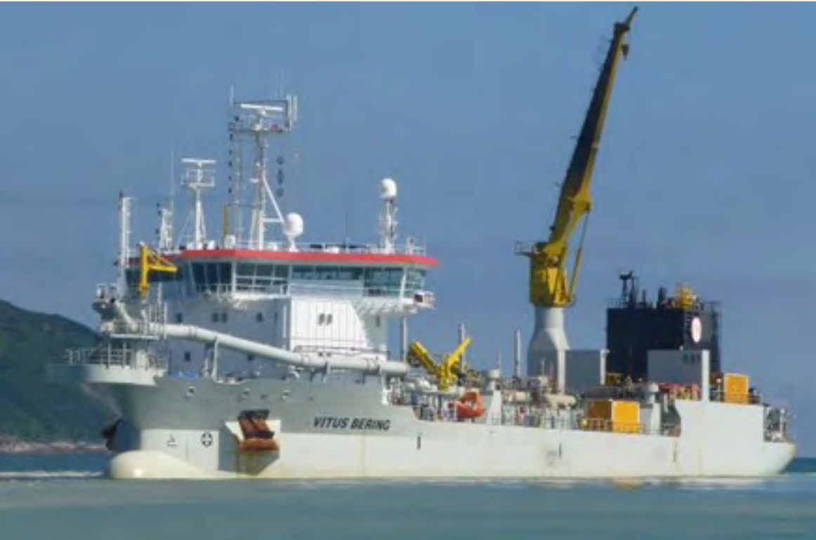
Vitus Bering (2018)

CUSTOMER: DEME TYPE: Trailing Suction Hopper Dredger (5600 m³) TYPE OF WORK: Refit SCOPE OF SUPPLY: Automation Systems, Draught and Loading System (ADLS), AMCS.