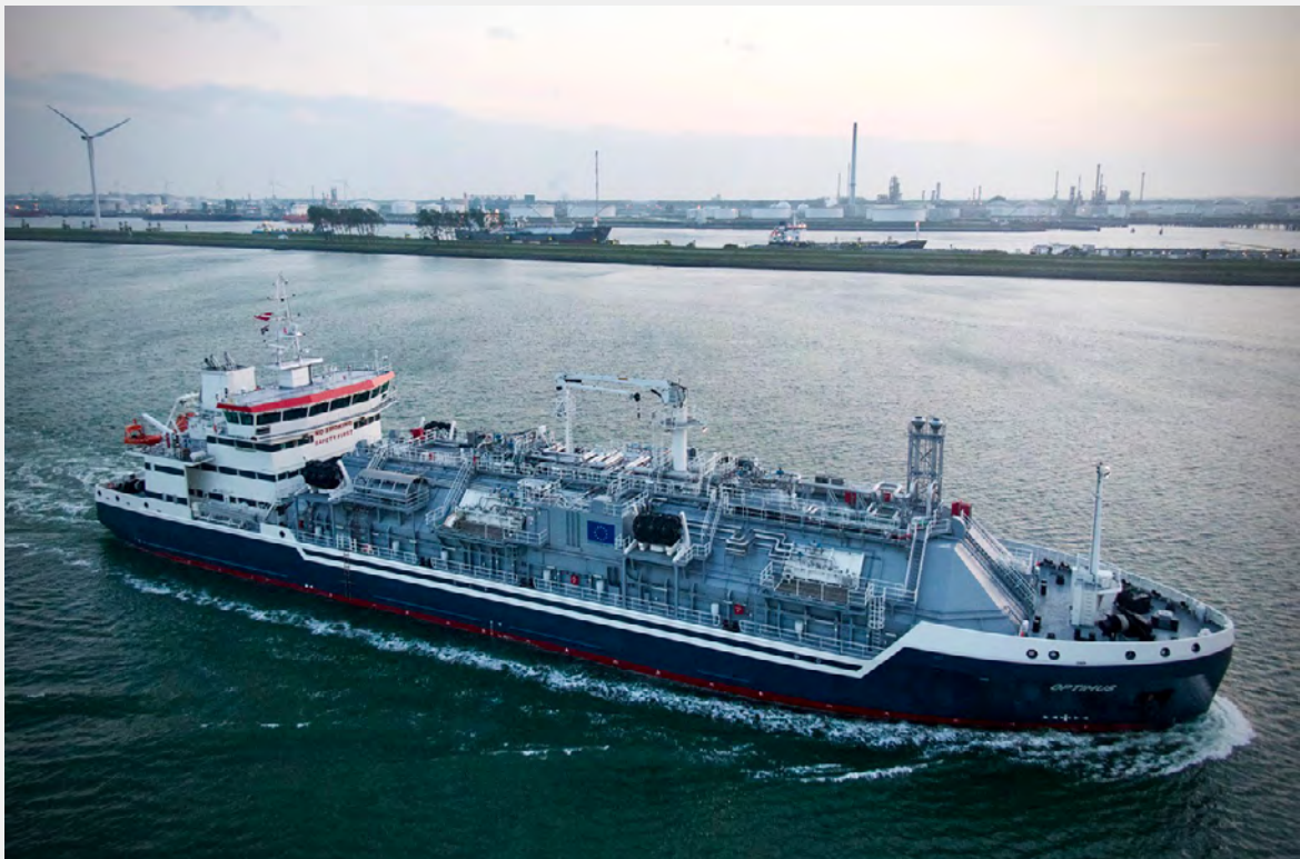
Optimus YN 559014 (2021)

CUSTOMER: Severnav Shipyard TYPE: 6500 m³ liquified gas tanker and 8600 m³ gas tankers TYPE OF WORK: Newbuild SCOPE OF SUPPLY: Complete electrical package, including engineering, commissioning, alarm, monitoring and control systems.