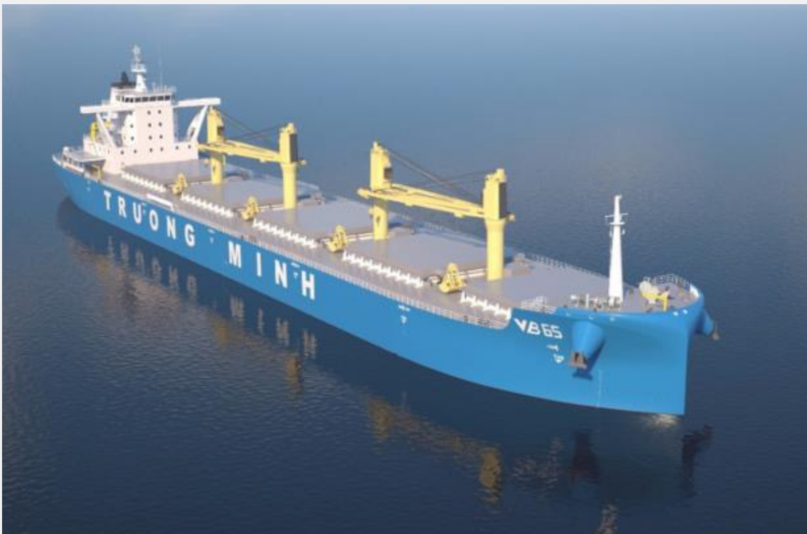
VB65- 1 & 2 (2024)

CUSTOMER: Dong Bac shipbuilding company TYPE: bulk carrier 65,000DWT TYPE OF WORK: Newbuild SCOPE OF SUPPLY: Engineering all switchboards, switchboards package & AMS.