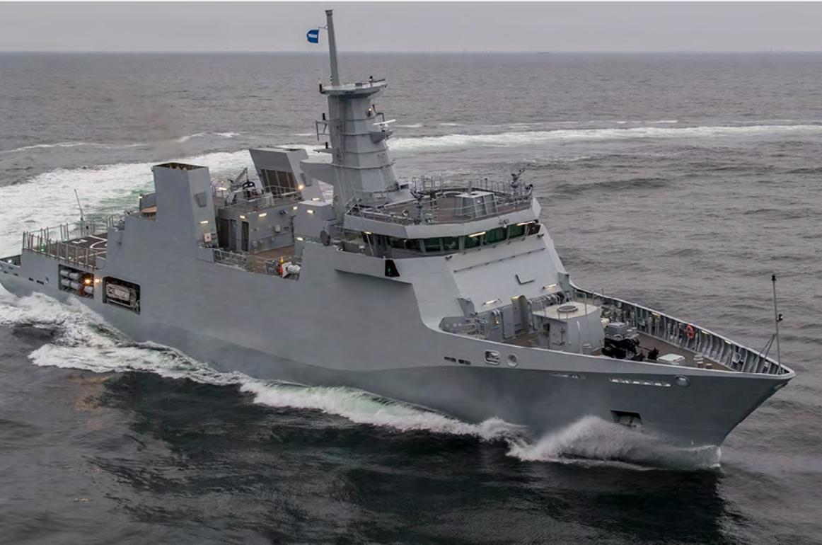
PNS Yarmook (2020)

CUSTOMER: Damen Shipyards Gorinchem TYPE: Offshore Patrol Vessel 1900 (90 m) TYPE OF WORK: Newbuild SCOPE OF SUPPLY: Electrical package delivery. Engineering, installing, commissioning and supervision.