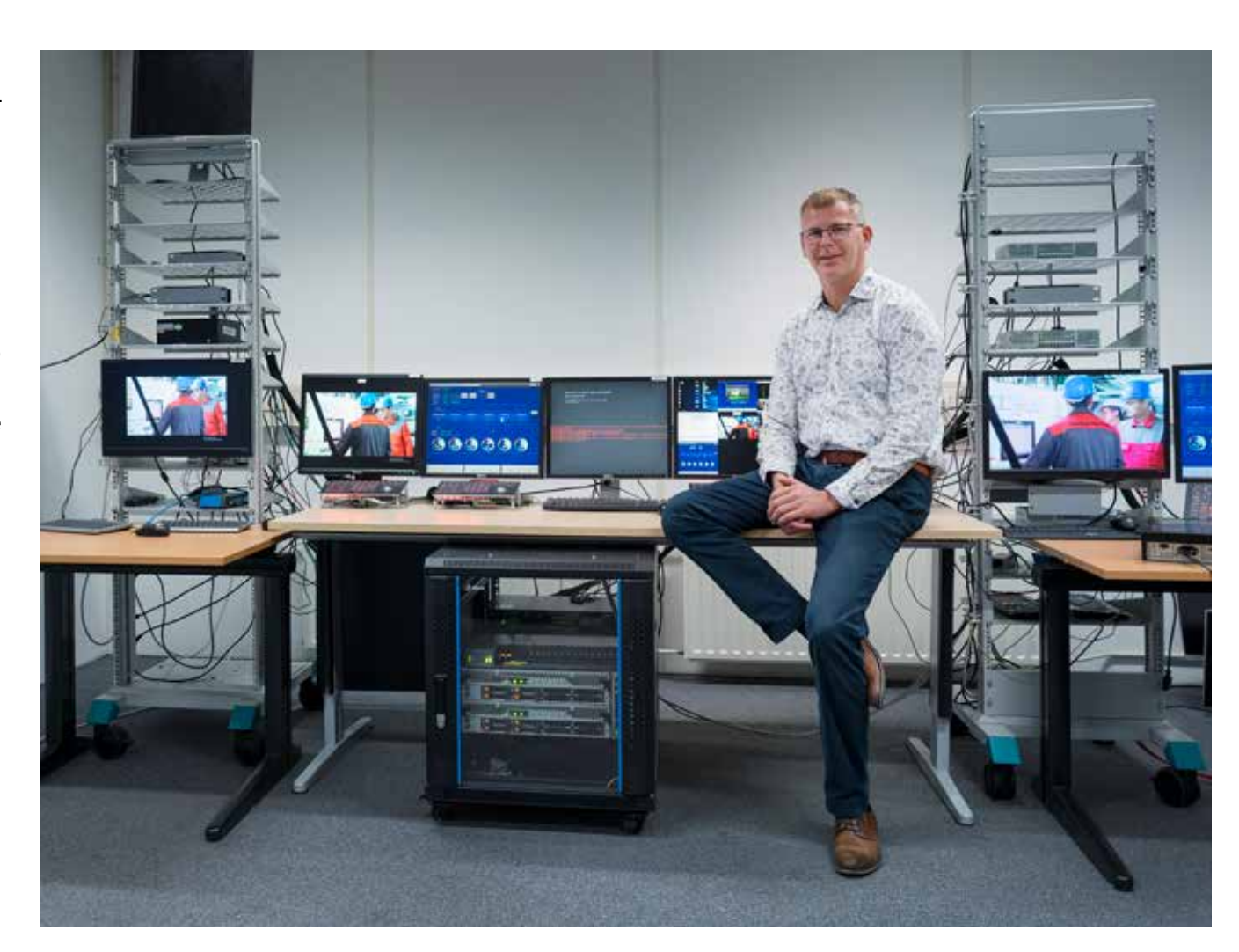
Alewijnse has developed a unique, future-proof digital platform that can replace most of the computer equipment on the bridge, thus saving space and, very importantly, money.

"Now, we are also retrieving more data from the system itself and visualizing it on the SCADA. For example, what is the fault count of the different processors? How is the health status of the server? Our customers now have one view of all critical systems that they can share anywhere on the ship. That visibility and access to information enables quicker response and better decision making for ship operations."